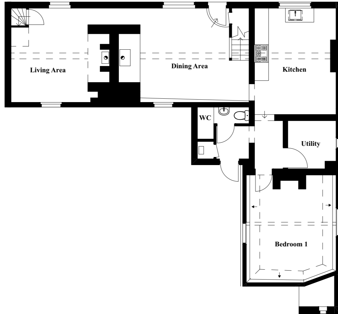
1:100 Proposed Ground Floor Plan (As Existing)