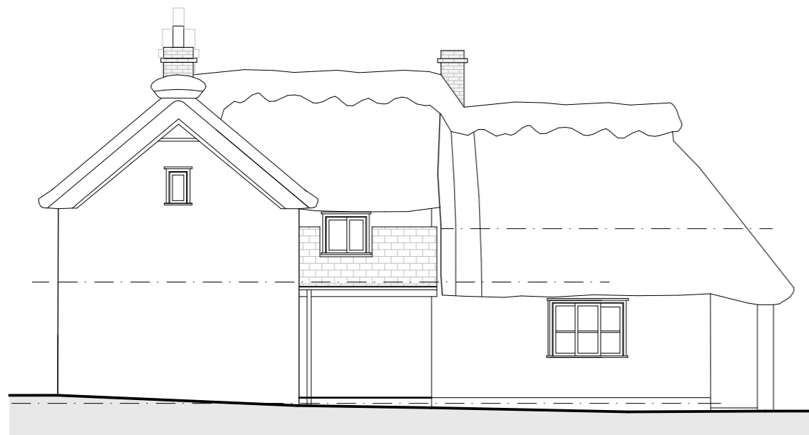
1:100 Existing Side 1 Elevation