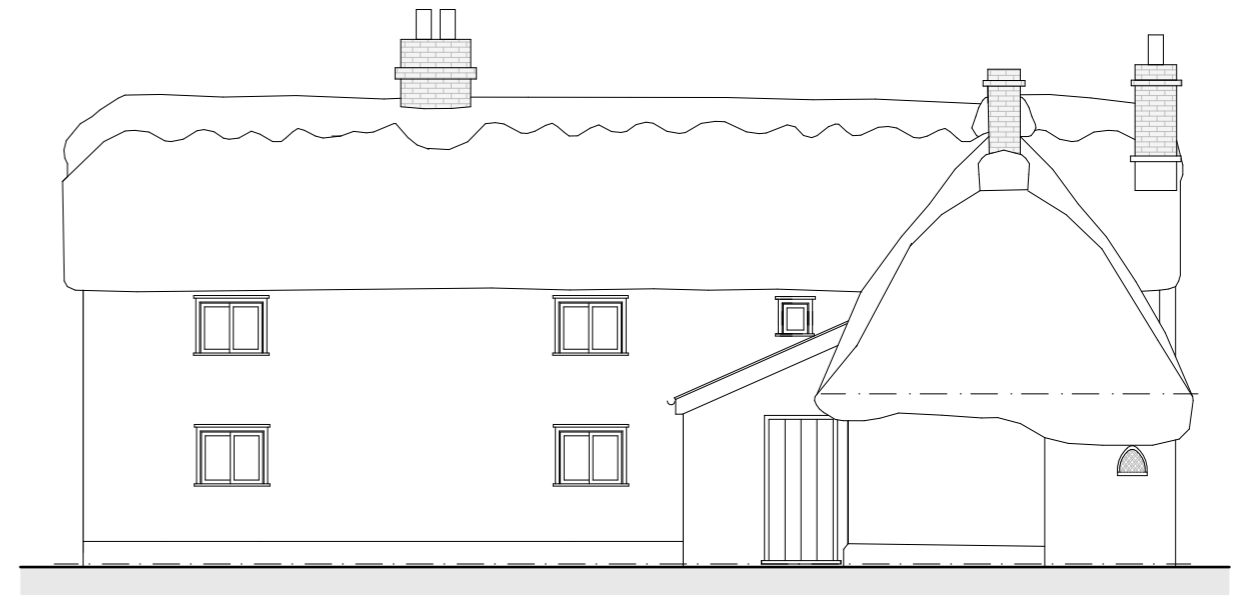
1:100 Existing Rear Elevation