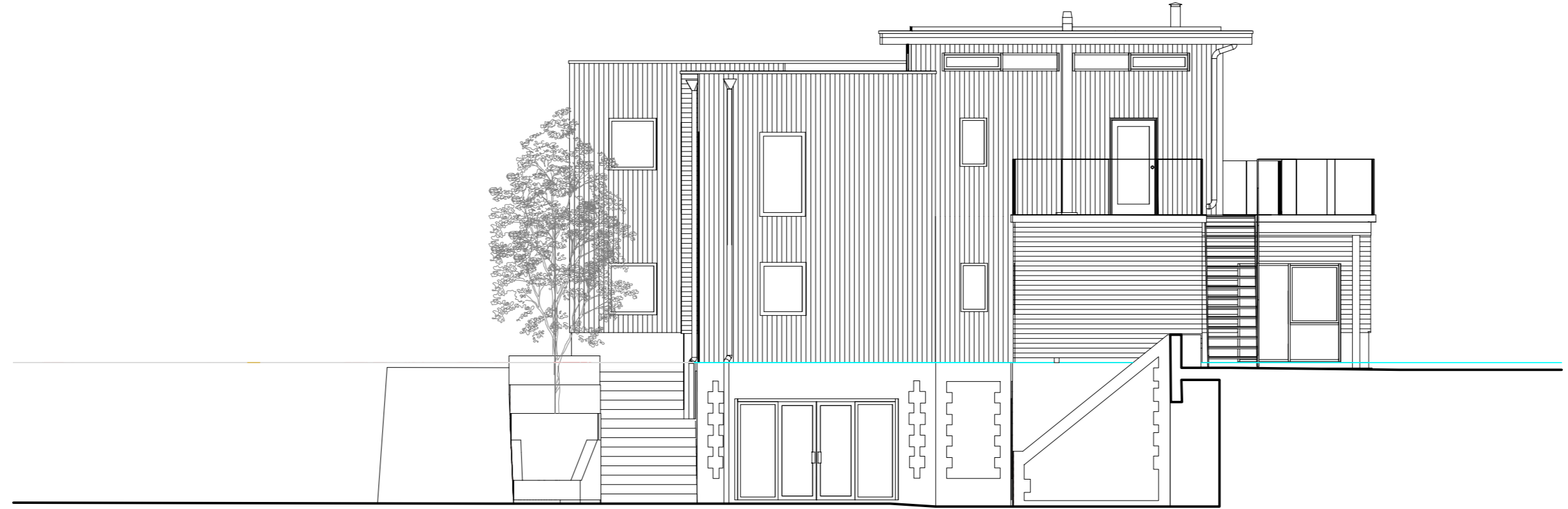
04 Existing West Elevation scale 1:100 @ A1