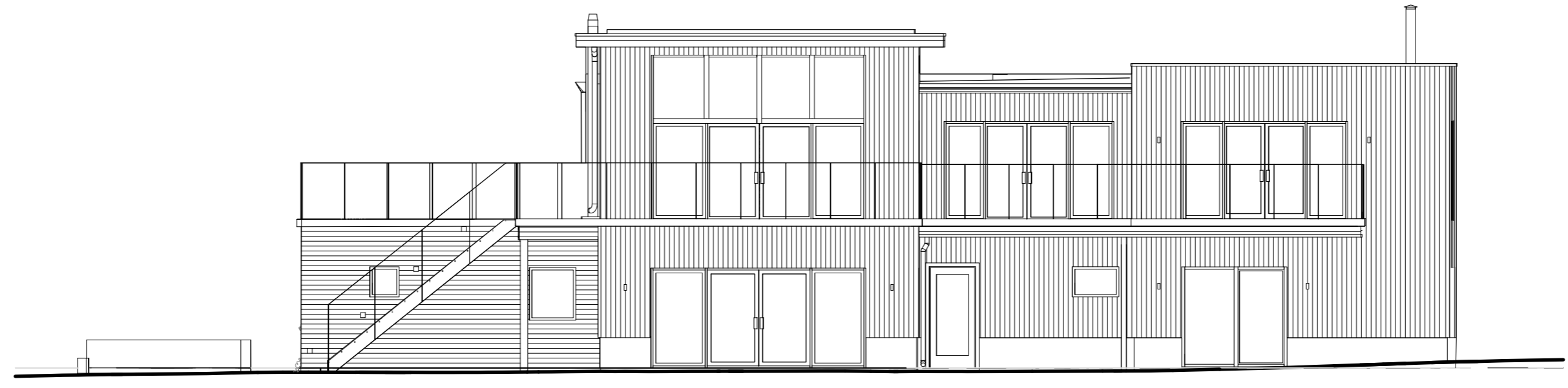
03 Existing South Elevation scale 1:100 @ A1