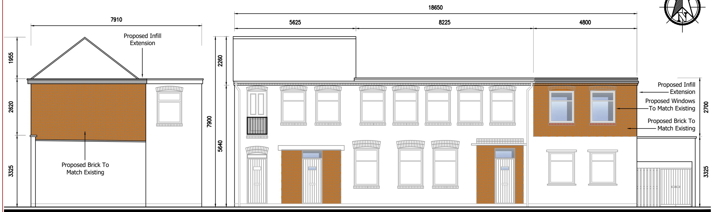
Proposed Side Elevation Scale 1:100