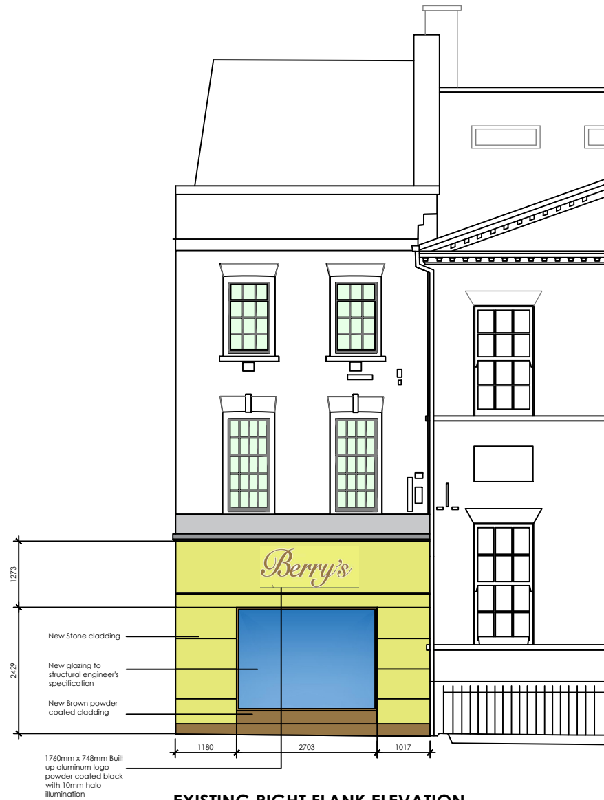
EXISTING RIGHT FLANK ELEVATION SCALE - 1:100 @ A3