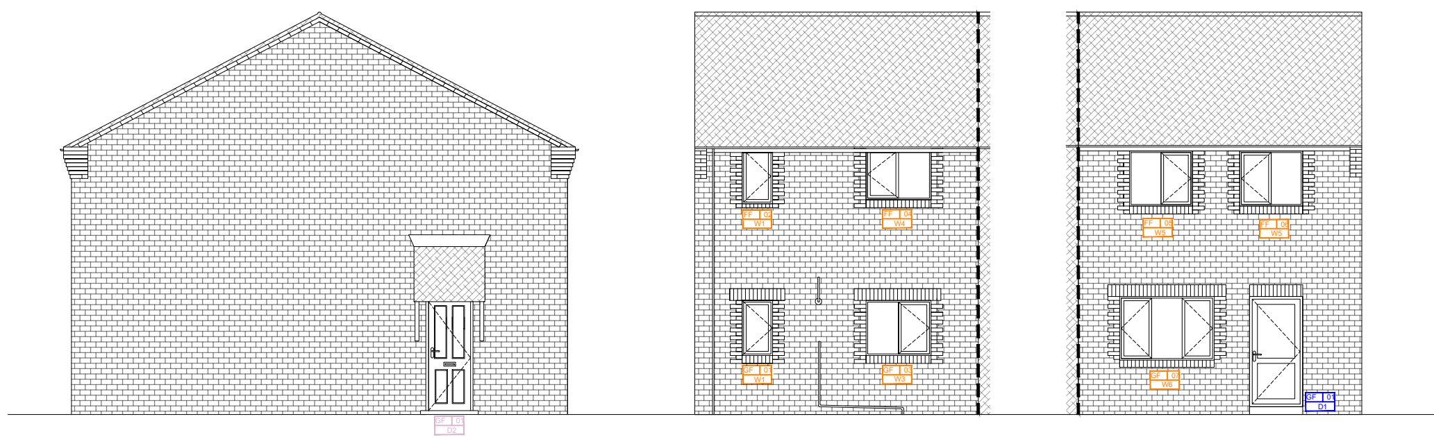
FRONT ELEVATION: 1:100

The contractor is responsible to ensure that no products are to be utilised that do not comply with relevant British and/or European Standards and/or Codes of Practice, COSHH Regulations, Construction Regulations, or which are known or suspected at the time of product selection and/or construction to be deleterious to health and safety or to the durability of the work or not in accordance with good building practices. The contractor is responsible for checking dimensions, tolerances, levels and references. This drawing/model is to be read in conjunction with all relevant Other Project Team Members' or specialists' drawings/models/any Federated Model. Any discrepancy is to be notified to Baily Garner LLP and is to be rectified before proceeding with the works on site or shop drawings. Where an item is covered by drawings to different scales, the larger scale drawing is to be worked to. Any rights (including copyright) in this drawing/model and any proprietary work contained therein belong to Baily Garner LLP and may only be used in accordance with the licence granted to the Employer and with attribution to Baily Garner LLP. The drawing to be read in conjunction with: Document Suitability Codes page or at www.bailygarner.co.uk/disclaimer/