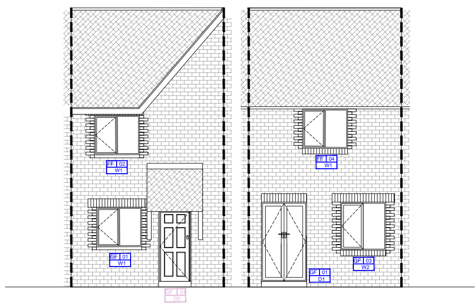
FRONT ELEVATION: 1:100

The contractor is responsible to ensure that no products are to be utilised that do not comply with relevant British and/or European Standards and/or Codes of Practice, COSHH Regulations, Construction Regulations, or which are known or suspected at the time of product selection and/or construction to be deleterious to health and safety or to the durability of the work or not in accordance with good building practices. The contractor is responsible for checking dimensions, tolerances, levels and references. This drawing/model is to be read in conjunction with all relevant Other Project Team Members' or specialists' drawings/models/any Federated Model. Any discrepancy is to be notified to Baily Garner LLP and is to be rectified before proceeding with the works on site or shop drawings. Where an item is covered by drawings to different scales, the larger scale drawing is to be worked to. Any rights (including copyright) in this drawing/model and any proprietary work contained therein belong to Baily Garner LLP and may only be used in accordance with the licence granted to the Employer and with attribution to Baily Garner LLP. The drawing to be read in conjunction with: Document Suitability Codes page or at www.bailygarner.co.uk/disclaimer/