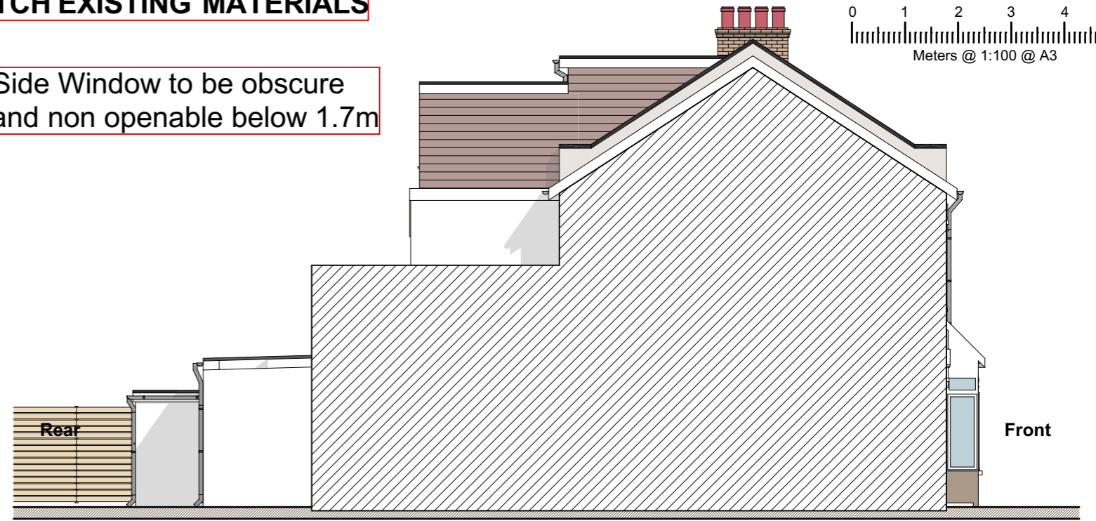
Proposed Flank Elevation 1:100