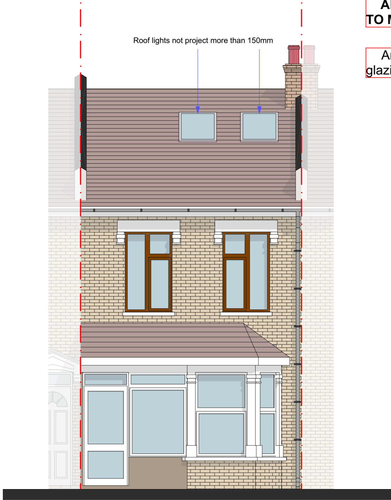
Proposed Front Elevation 1:50