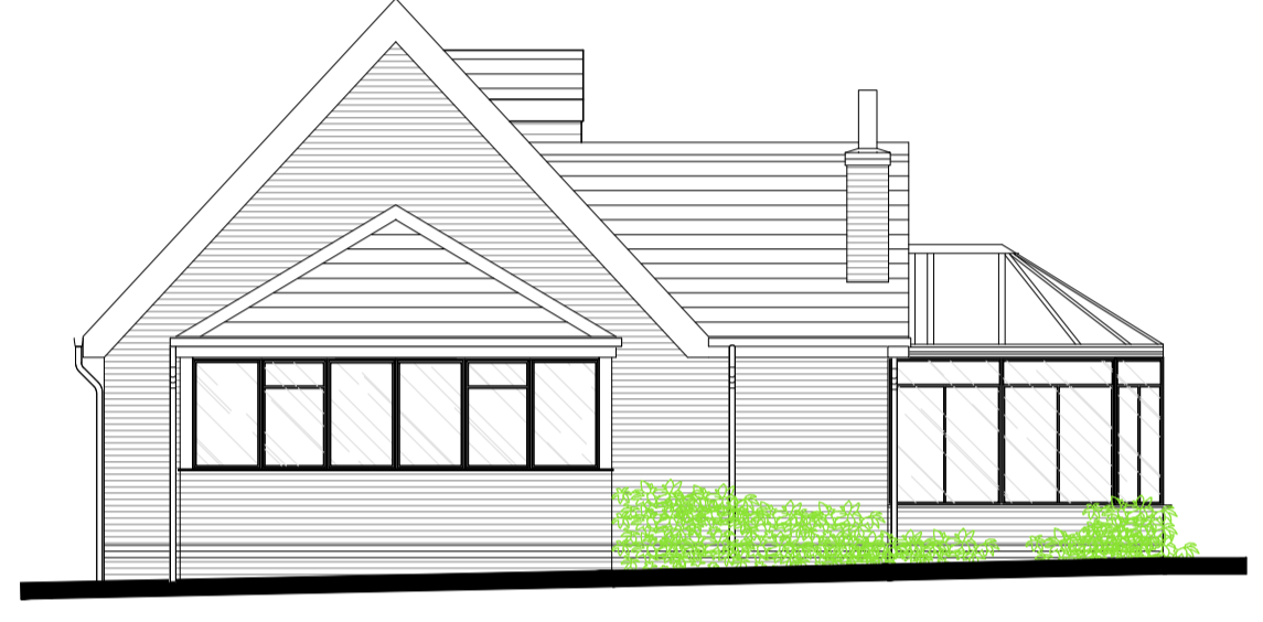
Existing North West Elevation (Side) 1:100