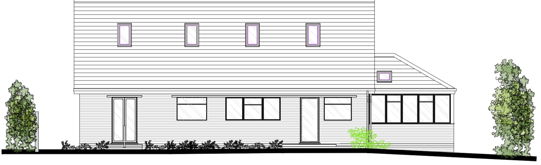
Existing North East Elevation (Rear) 1:100