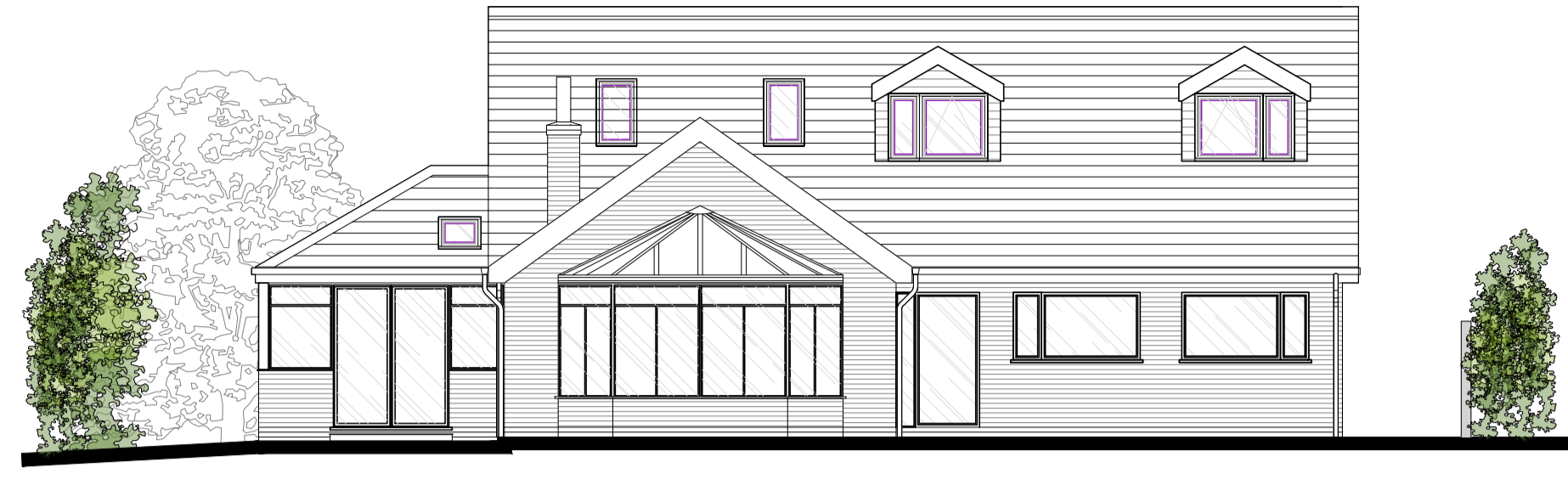
Existing South West Elevation (Front) 1:100