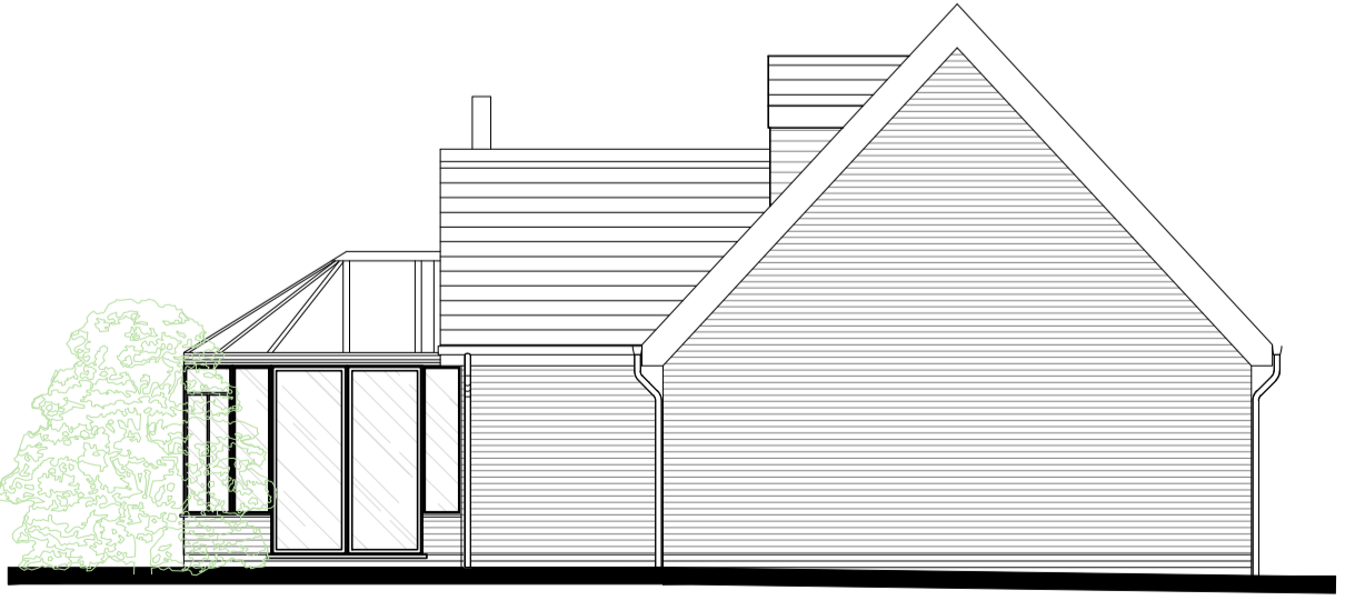
Existing South East Elevation (Side) 1:100

Printed or electronic copies of this drawing can be scaled for planning purposes only. Any discrepancies with this drawing to be reported and clarified prior to commencing work on site, if in doubt - Ask. Corporate Architecture Ltd accept no responsibility for works not undertaken fully in accordance with this drawing and relevant specifications. Copyright © Corporate Architecture Limited