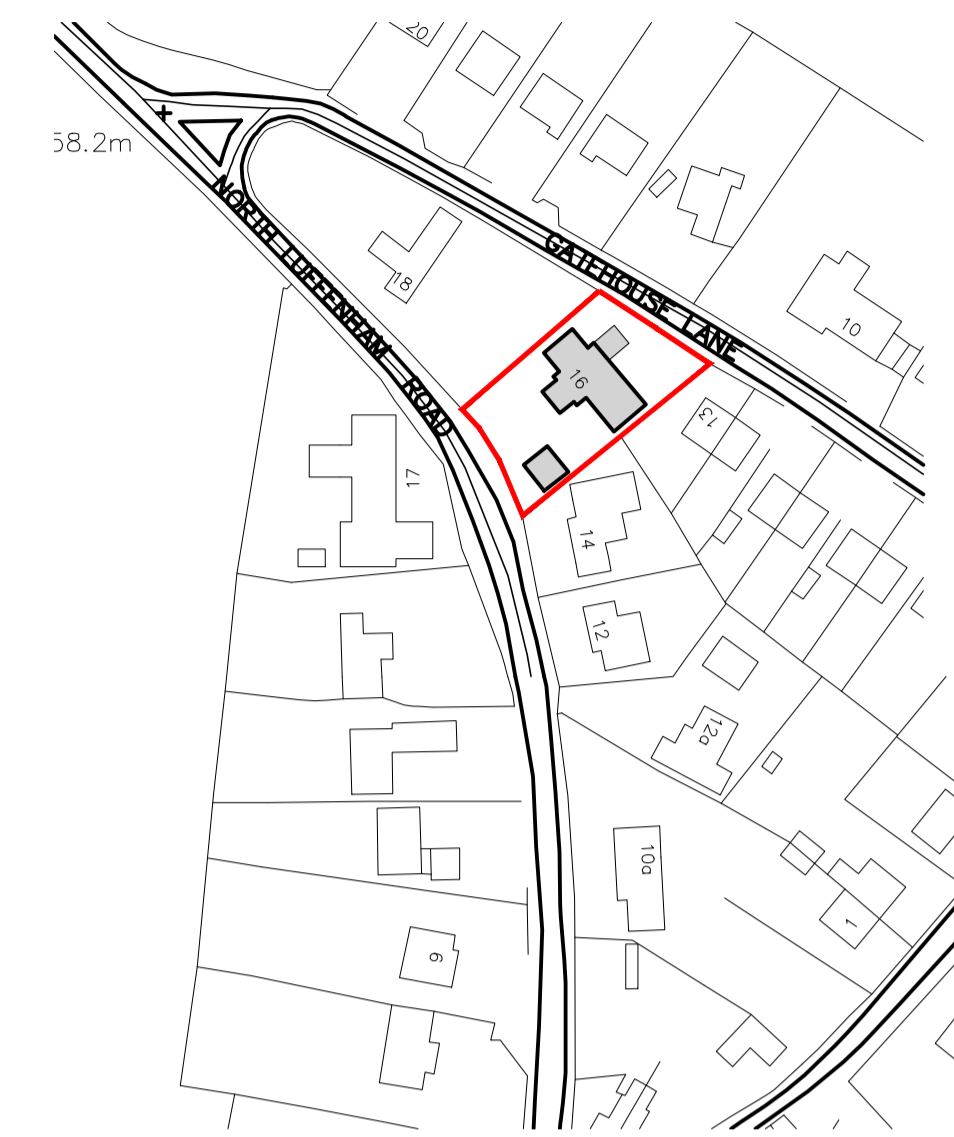
Location Plan 1:1250 0 12.5m 25m 37.5m 50m 62.5m 75m 1:1250