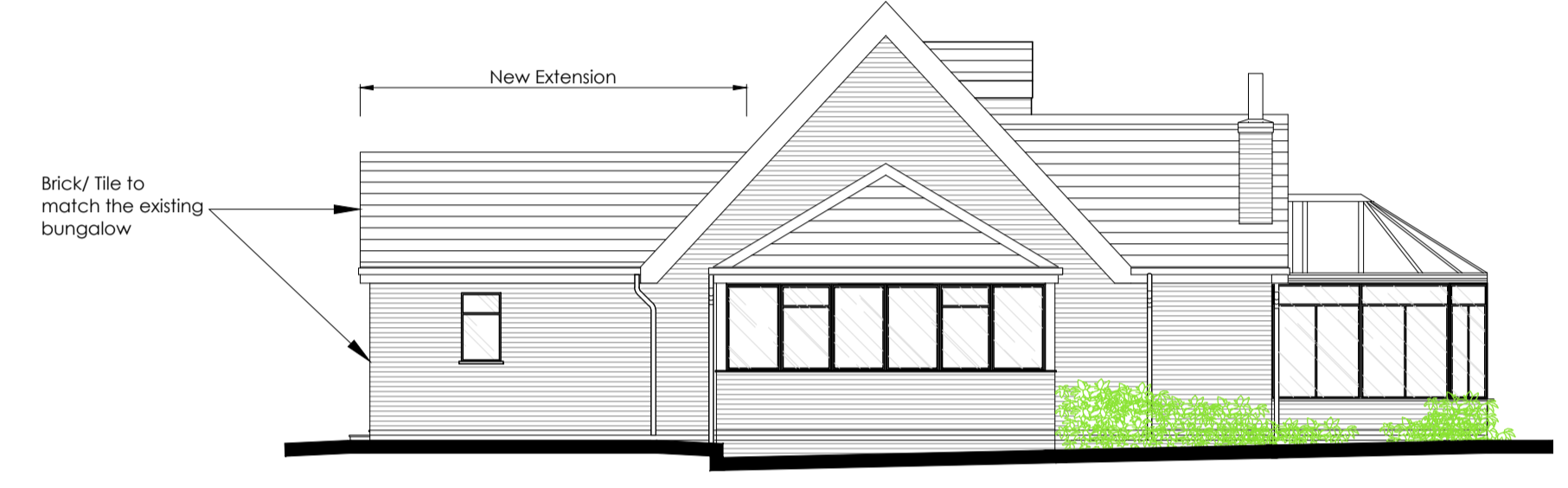
Proposed North West Elevation (Side) 1:100