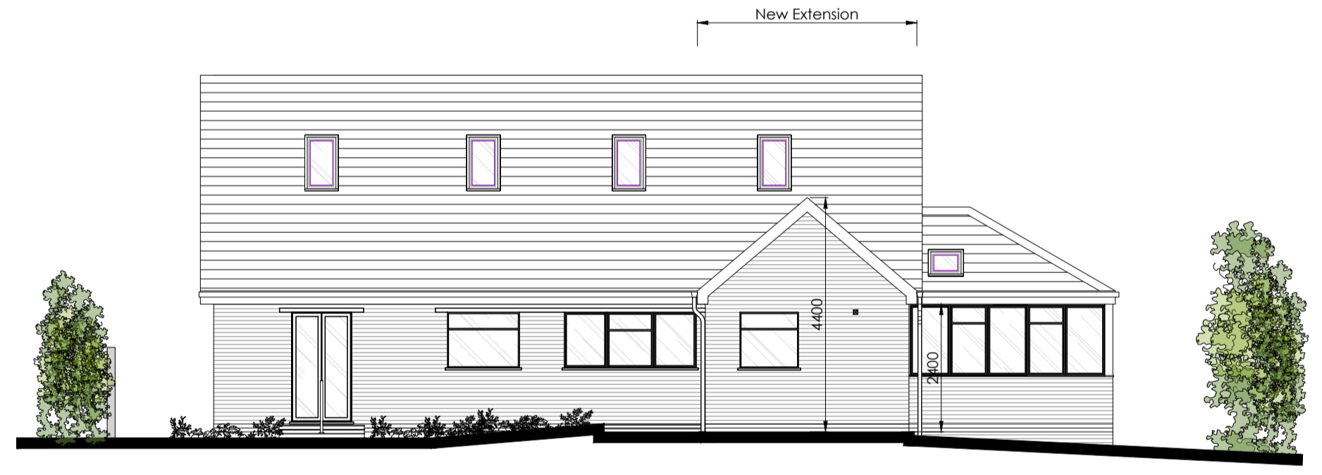
Proposed North East Elevation (Rear) 1:100