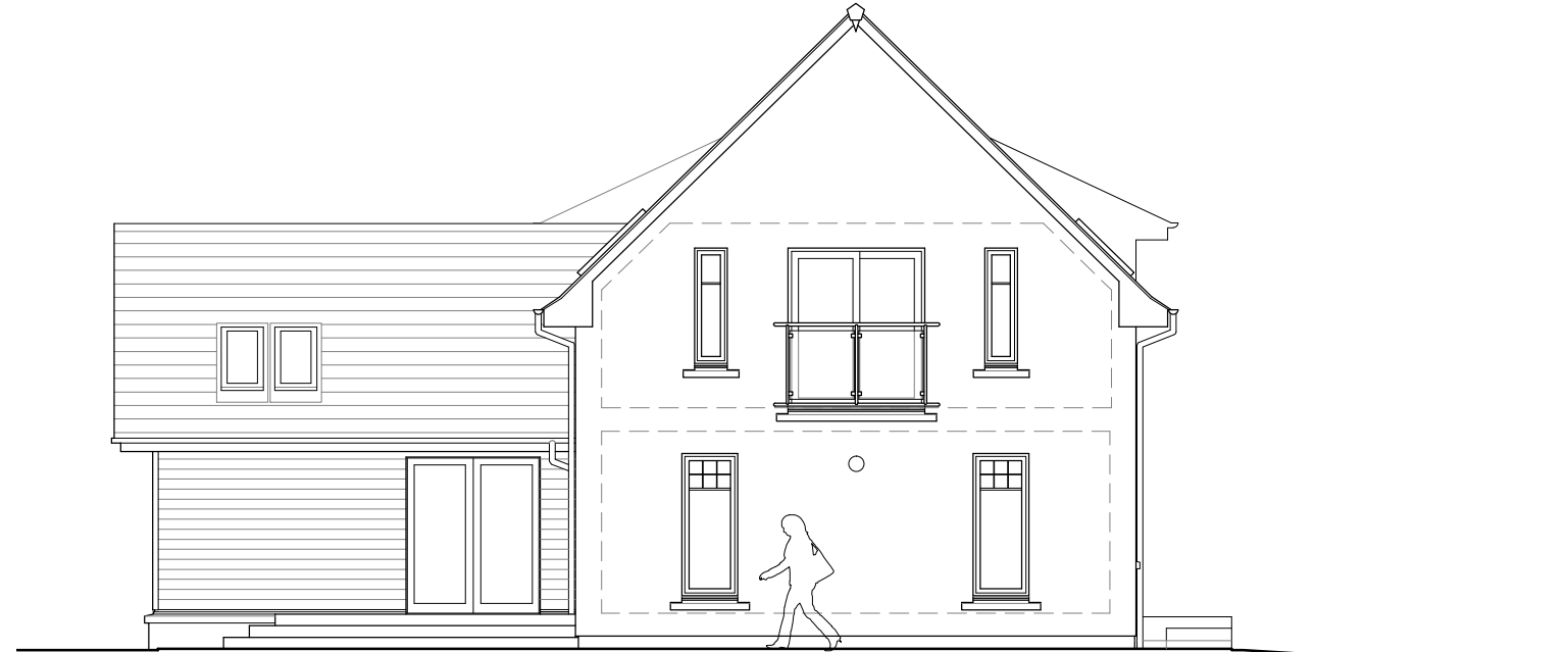
Existing North Elevation 1:100