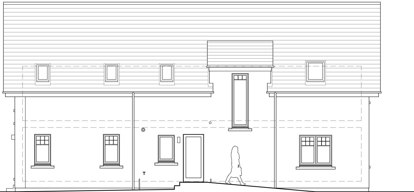
Existing West Elevation 1:100