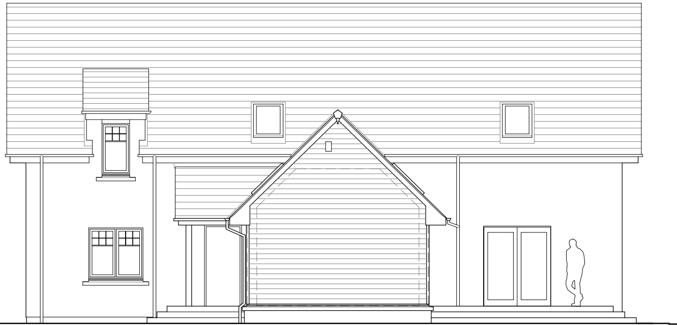
Existing East Elevation 1:100