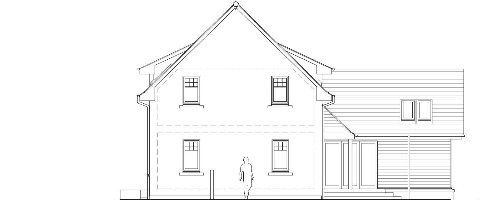
Existing South Elevation 1:100