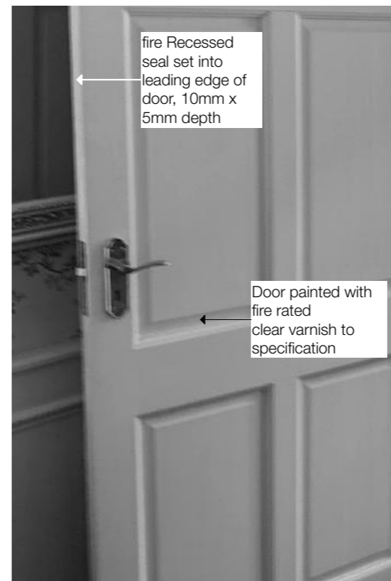
Illustration showing proposed fire seal installation

Existing doors to be upgraded to 30 min fire rating, receive new fire seals + door closer + coated with envirograf paint