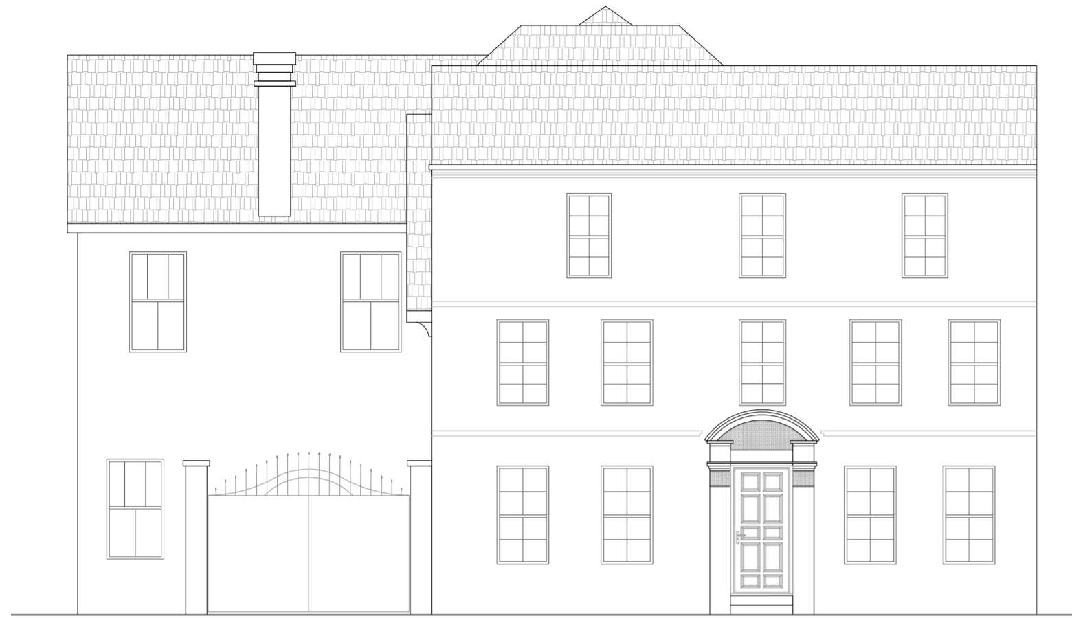
Front elevation Scale 1:100