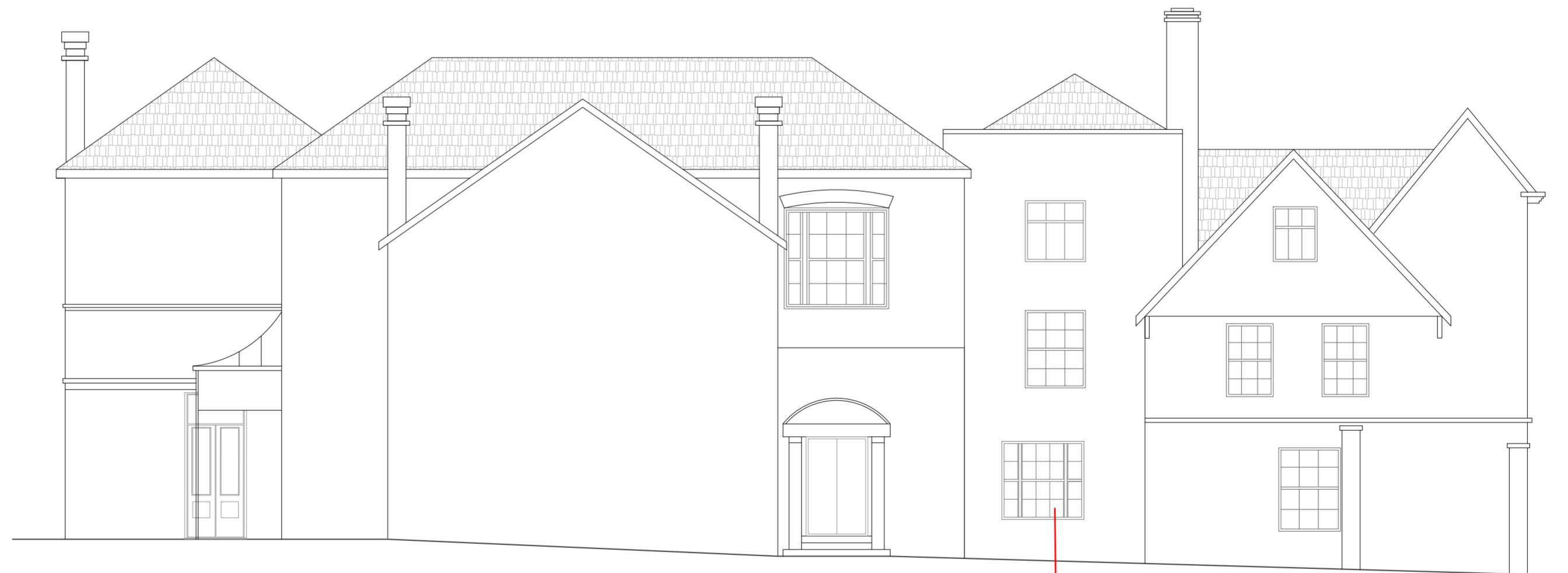
Side elevation Scale 1:100