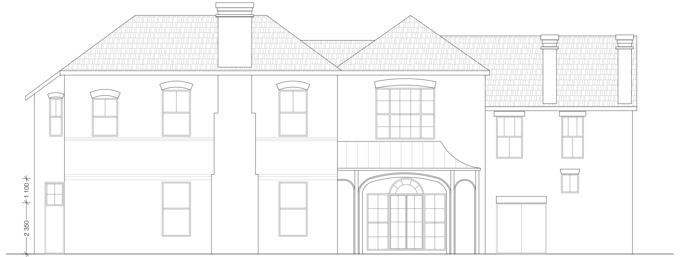
Rear elevation Scale 1:100