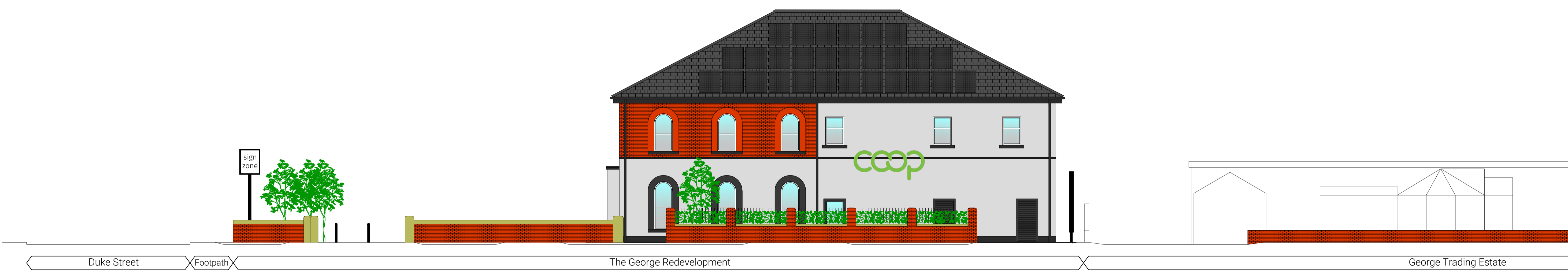
3 VIEW FROM CEMETRY ROAD 1:100