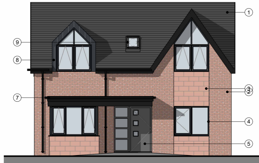
1 Front Elevation Scale: 1 : 100

REV: DATE: DESCRIPTION: BY: A 12.01.24 Status updated to 'Planning'. Roof amended OM