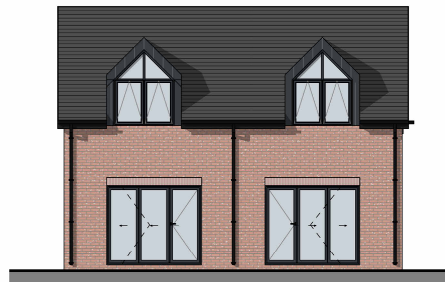
4 Rear Elevation Scale: 1 : 100