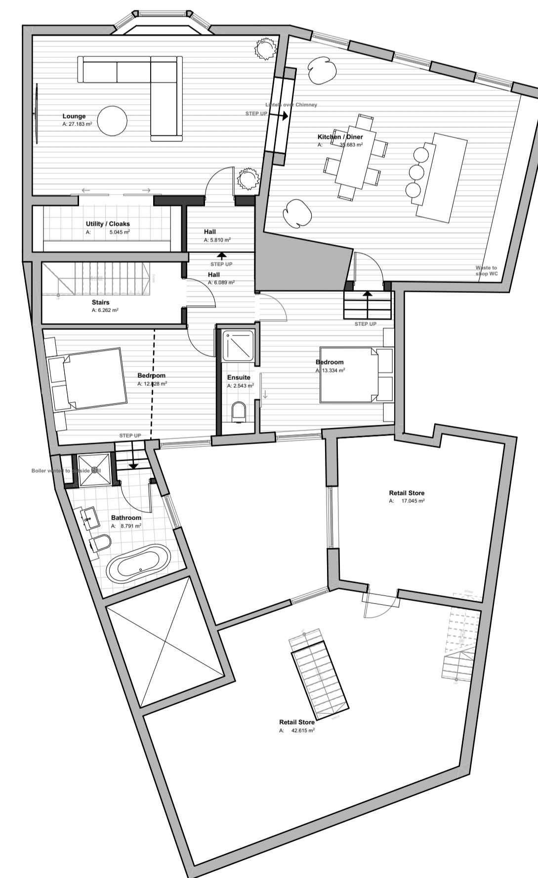
1. First Floor as Proposed 1:100