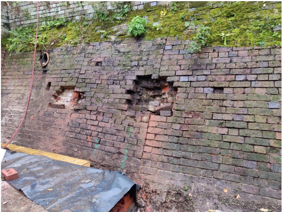
Fig.5 South wall, section to east of buttress, taken 29/09/22