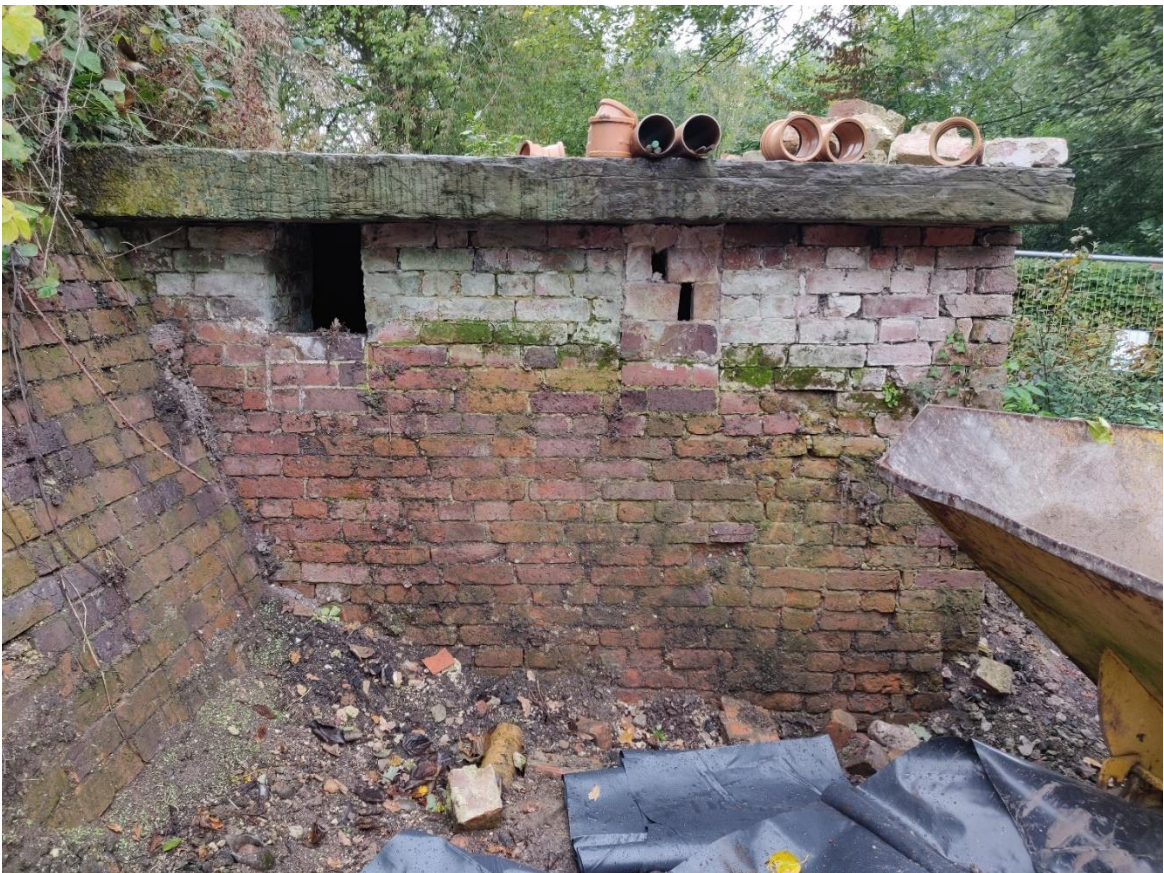
Fig.7 South wall, section to west of buttress (showing section hidden in figure 6 and east wall of privy), taken 29/09/22