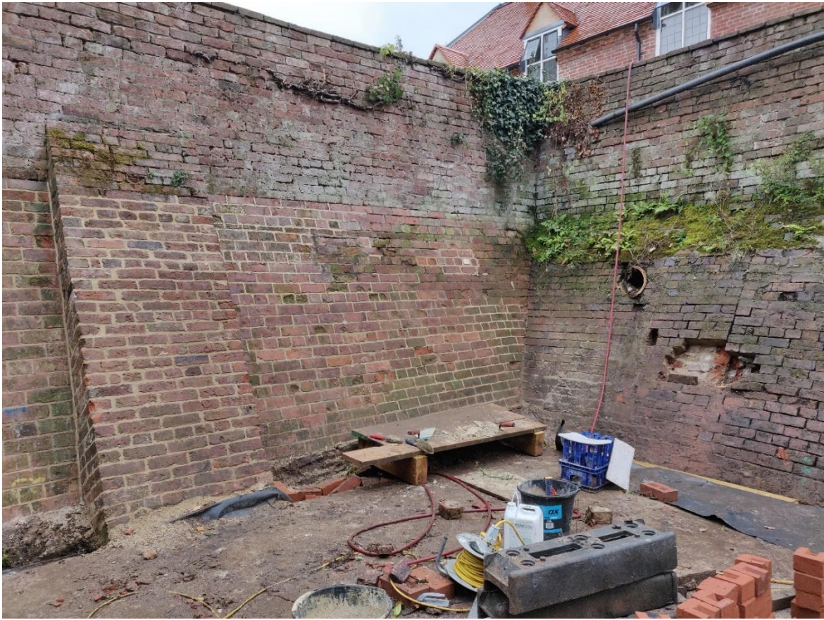
Fig.4 East wall, section to south of buttress, taken 29/09/22