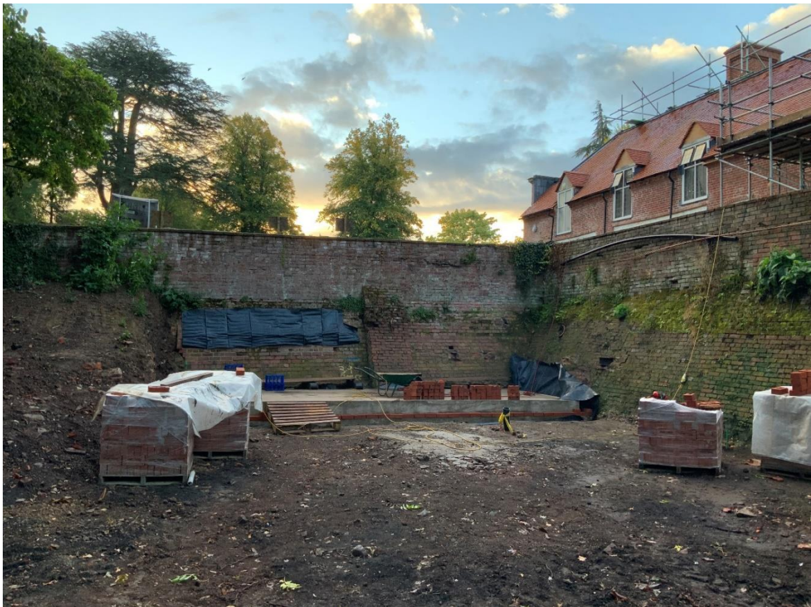
Fig.2 Location photograph, showing Coach House in background, taken 03/09/22