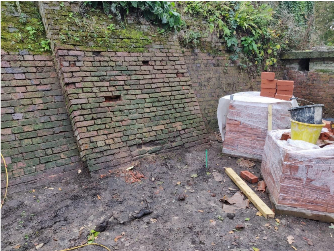
Fig.6 South wall, section to west of buttress, taken 29/09/22