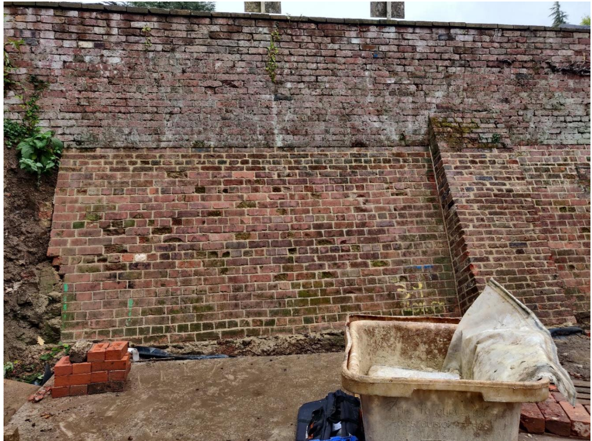
Fig.3 East wall, section to north of buttress, taken 29/09/22