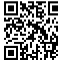
GOOGLE MAPS QR CODE

GOOGLE MAPS - https://maps.app.goo.gl/Tt8PytypDs4Zyp7W6