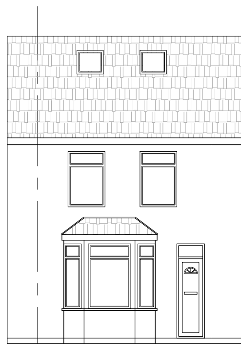
Existing / Proposed Front Elevation