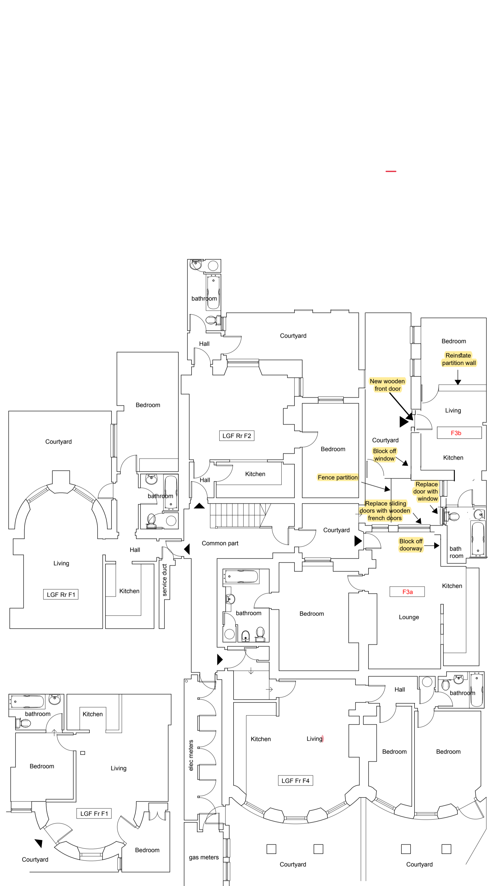
Lower Ground Floor Plan Scale 1:100 @ A1