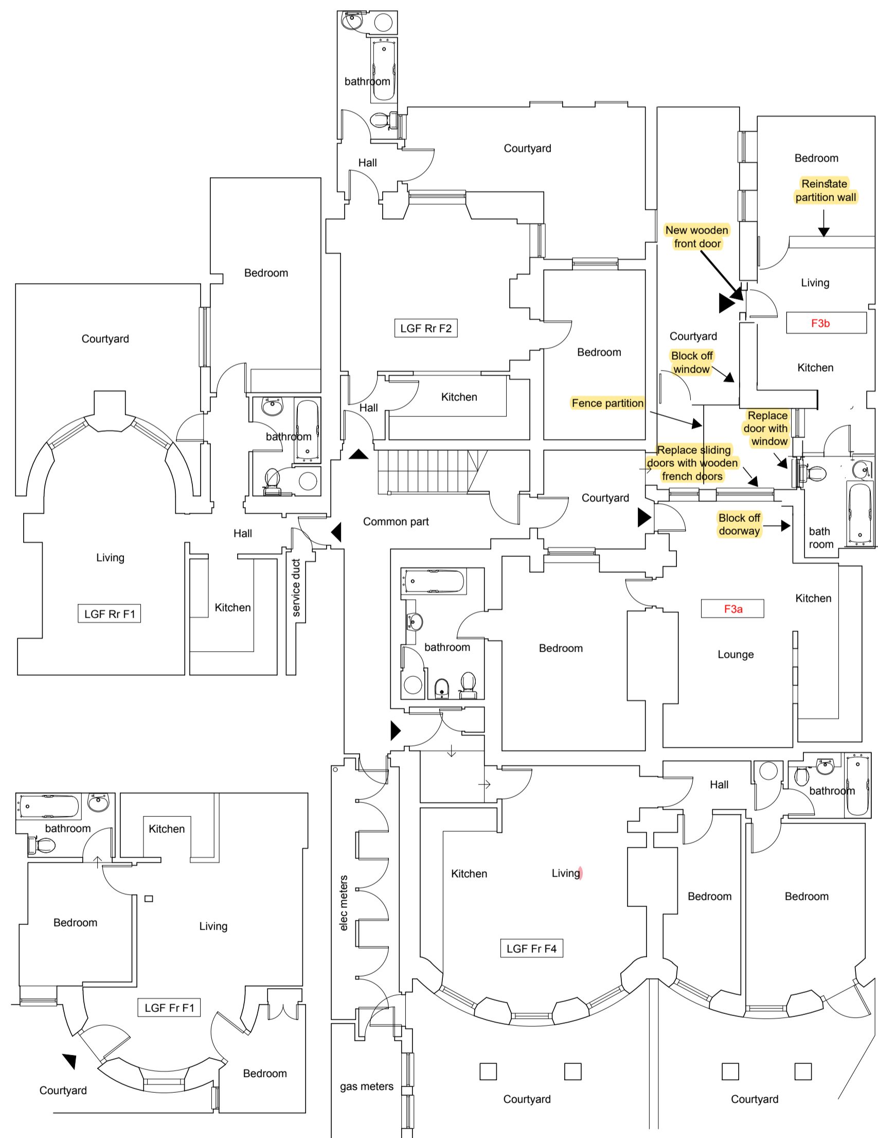
Lower Ground Floor Plan Scale 1:100 @ A1