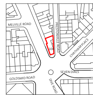
Locality Plan scale 1 : 1000