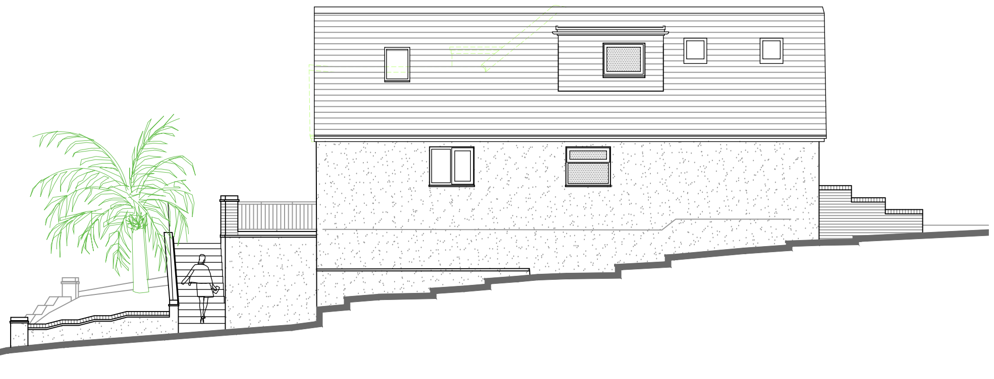
side elevation east