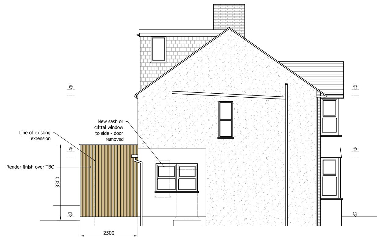
EXISTING SIDE (WEST) ELEVATION scale 1:100