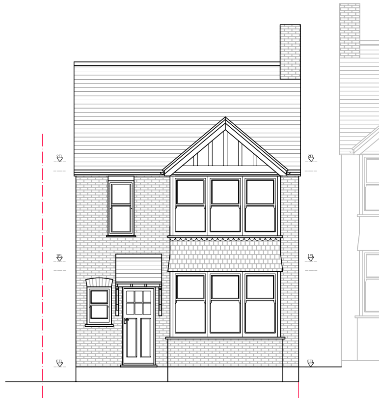
EXISTING FRONT (NORTH) ELEVATION scale 1:100