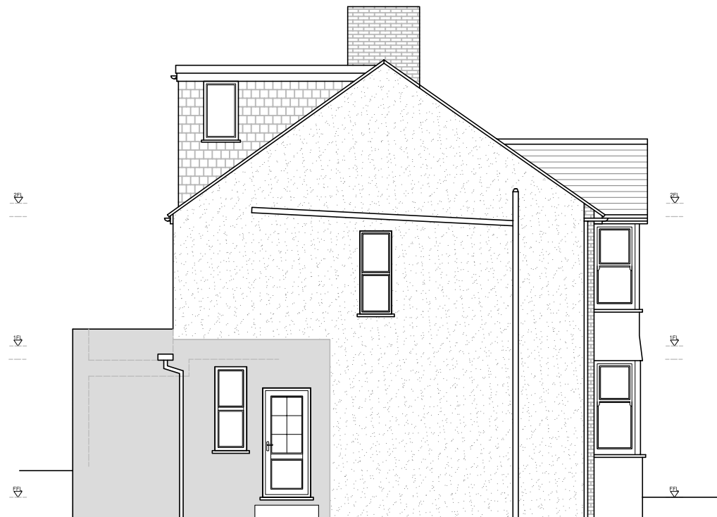
EXISTING SIDE (WEST) ELEVATION scale 1:100