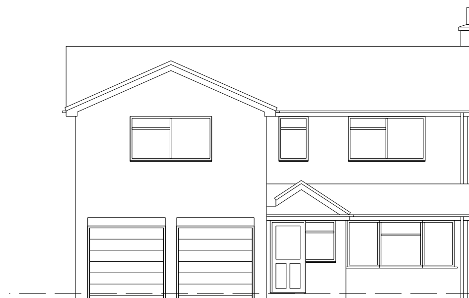
FRONT ELEVATION - SOUTH