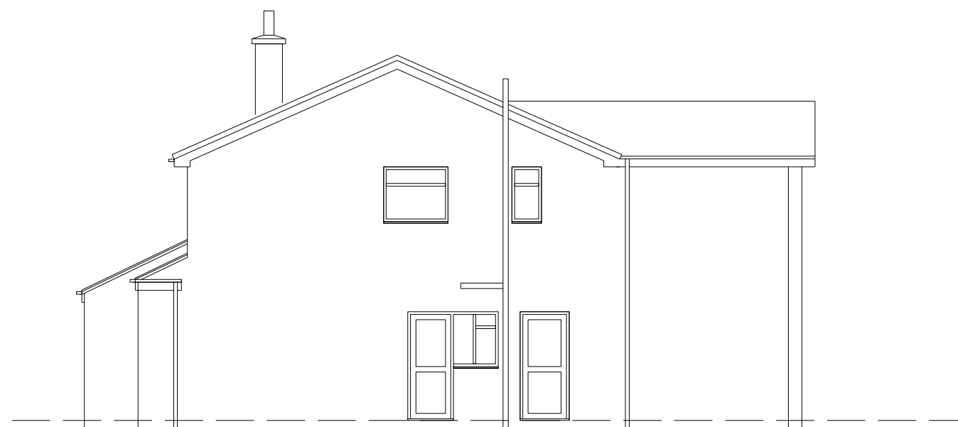
SIDE ELEVATION - WEST