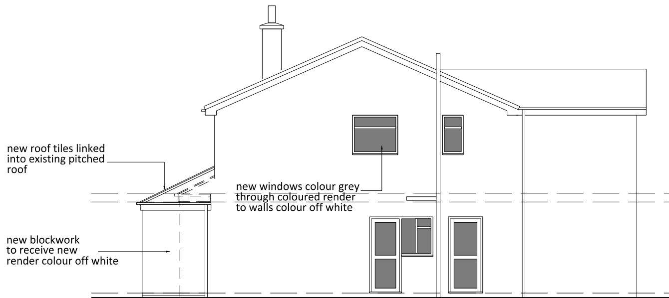
SIDE ELEVATION - WEST