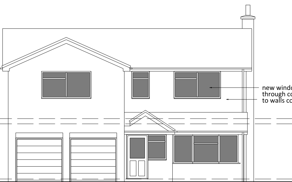
FRONT ELEVATION - SOUTH