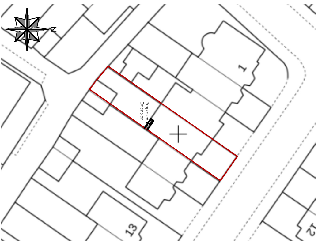
METRES Scale 1:500 Block Plan