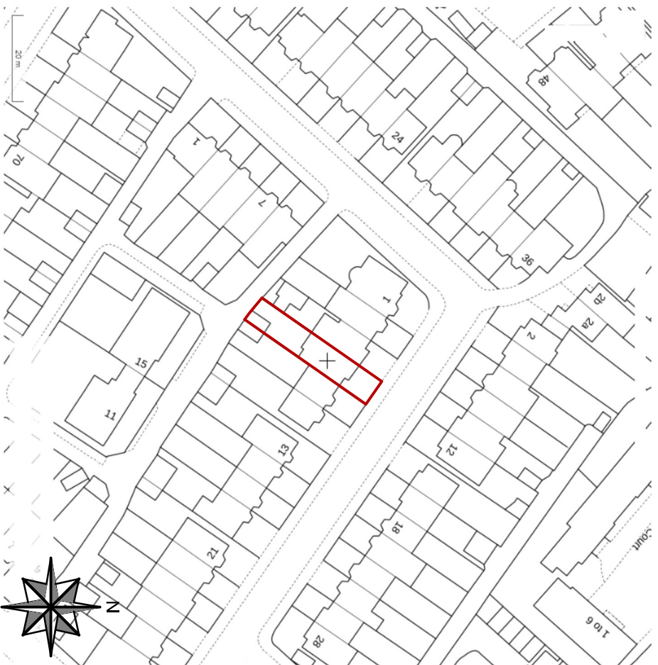
METRES Scale 1:1250 Location Plan