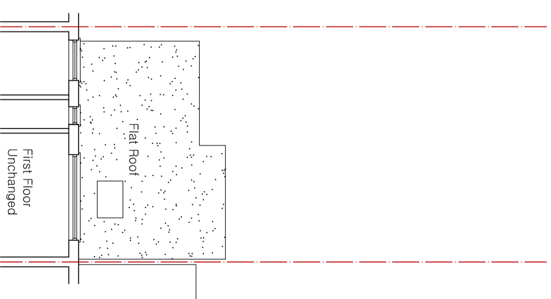
Existing Part First Floor Plan