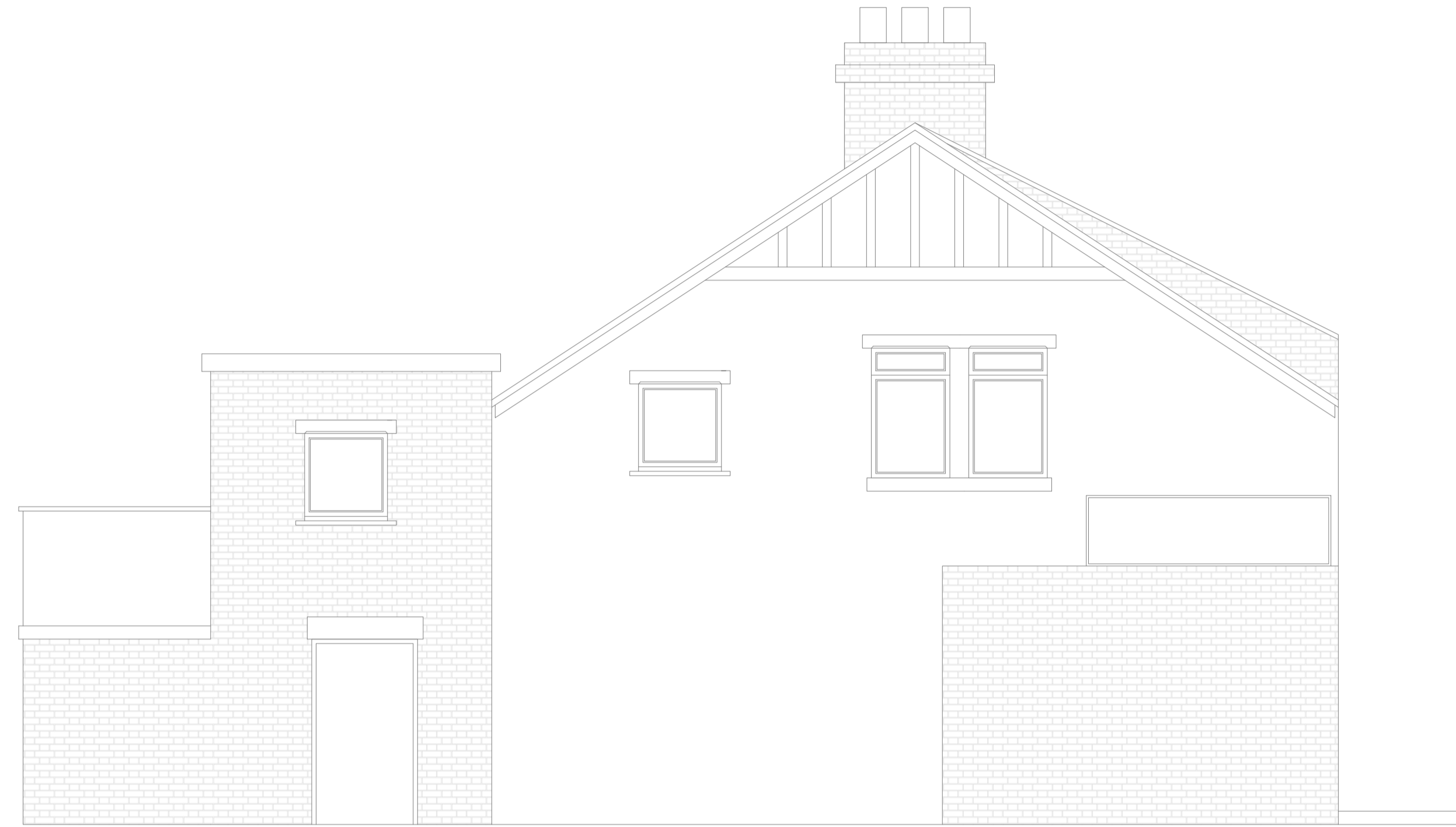
PROPOSED SHOP LEFT SIDE ELEVATION SCALE 1:50