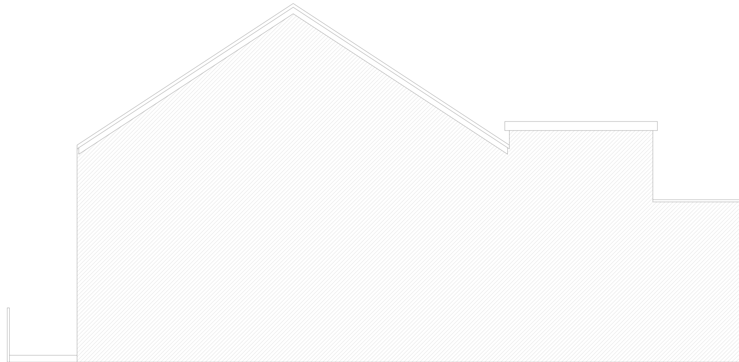
PROPOSED SHOP RIGHT SIDE ELEVATION SCALE 1:50