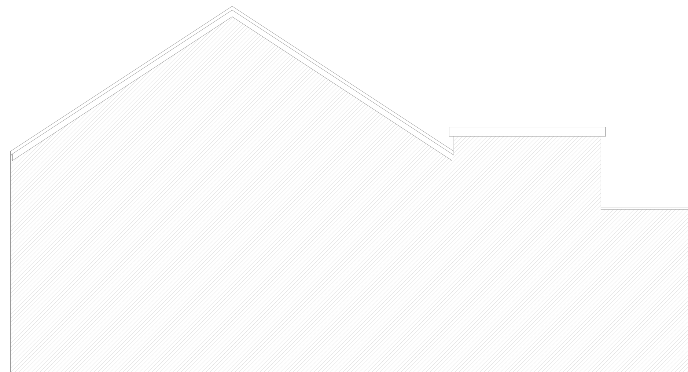
EXISTING SHOP RIGHT SIDE ELEVATION SCALE 1:50