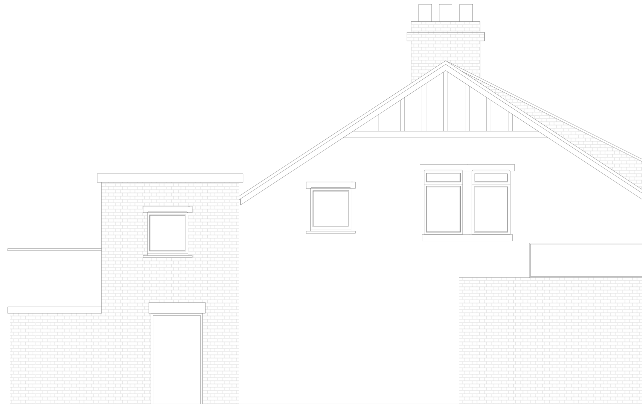
EXISTING SHOP LEFT SIDE ELEVATION SCALE 1:50