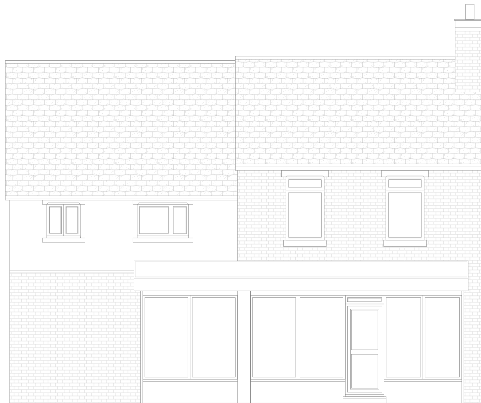
EXISTING SHOP FRONT ELEVATION SCALE 1:50