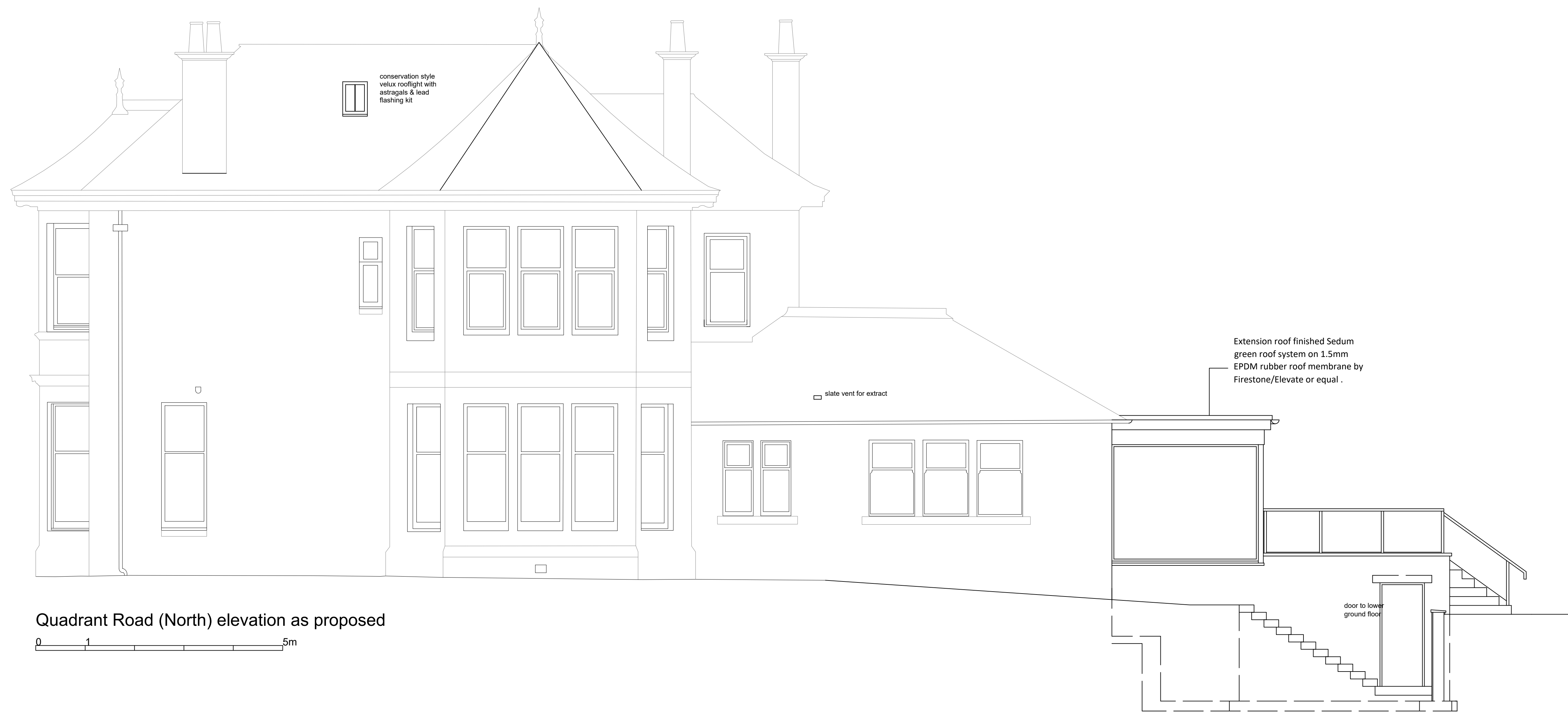
Quadrant Road (North) elevation as proposed