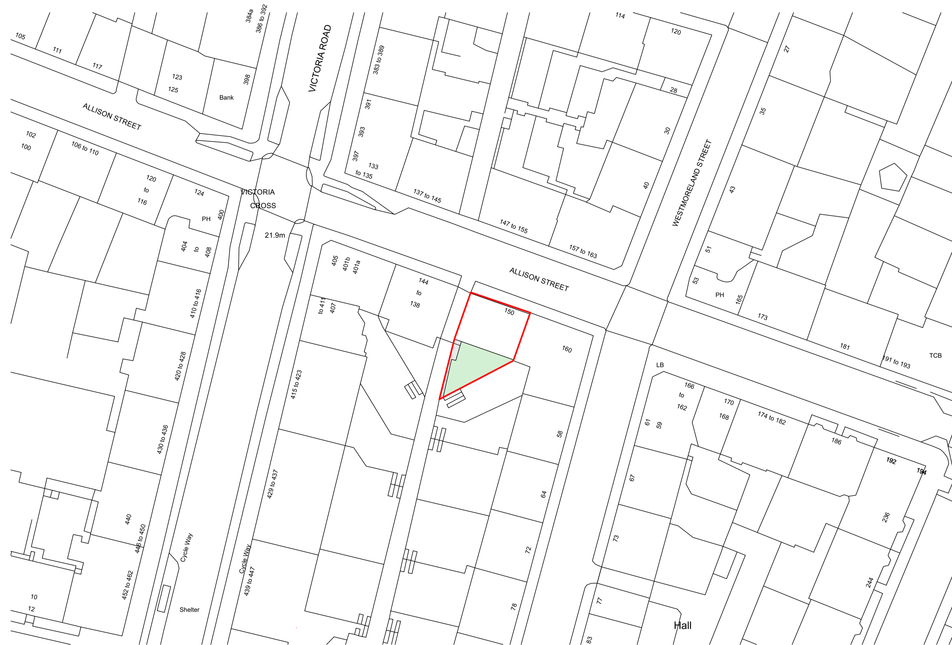
1 SITE PLAN @ 1:500