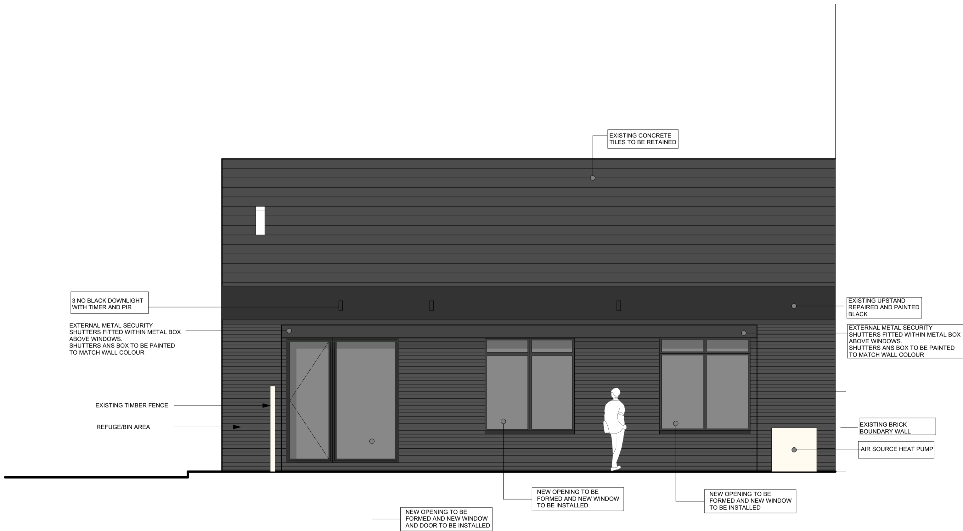
2 PROPOSED SOUTH ELEVATION @ 1:50 201 PRIVATE BACK GARDEN

SECURITY SHUTTERS: NORTH ELEVATION INTERNAL RETRACTABLE SECURITY GRILLES ( GREY/BLACK TO MATCH WINDOW FRAMES) TO NORTH ELEVATION / ALLISON STREET ELEVATION. HINGED METAL GATE AT MAIN ENTRANCE SOUTH ELEVATION EXTERNAL METAL SECURITY SHUTTERS FITTED WITHIN METAL BOX ABOVE WINDOWS. SHUTTERS ANS BOX TO BE PAINTED TO MATCH WALL COLOUR PAINT SOUTH, WEST AND NORTH ELEVATIONS TO BE PAINTED GREY/BLACK. WINDOWS WINDOWS TO BE ALUMINIUM CLAD TIMBER WINDOWS FINISHED IN GREY BLACK