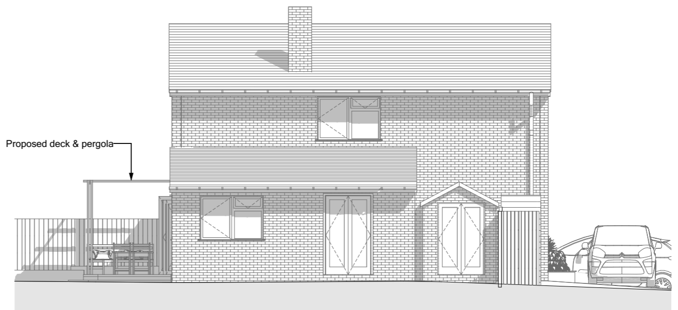
PROPOSED SIDE ELEVATION 1:100 29 Beaufort Road, Fleet