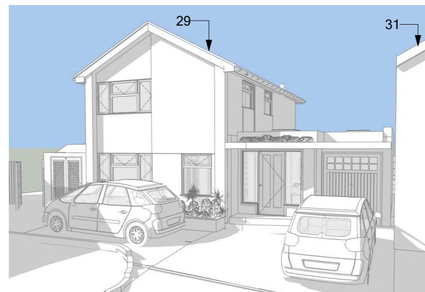
PROPOSED FRONT 3D VIEW 29 Beaufort Road, Fleet