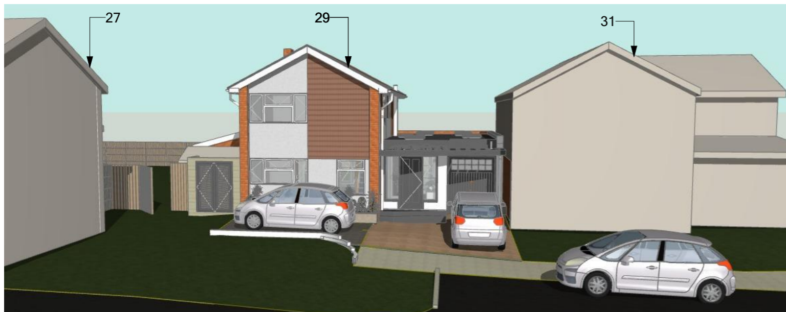
PROPOSED STREET SCENE 3D VIEW 29 Beaufort Road, Fleet