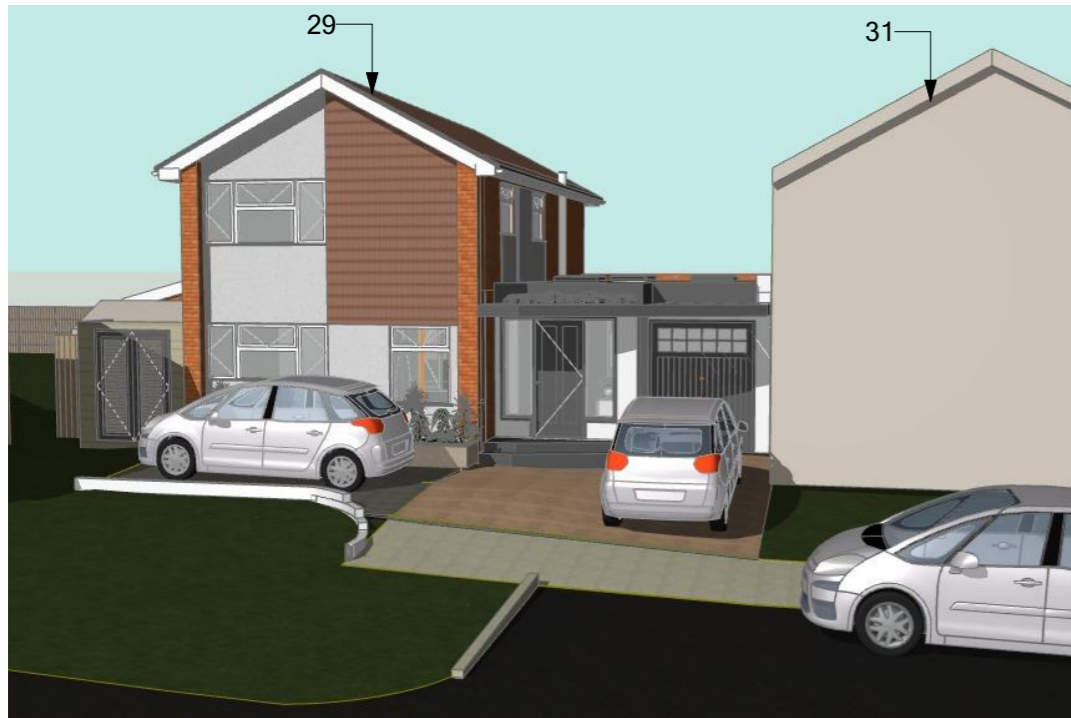
PROPOSED FRONT 3D VIEW 29 Beaufort Road, Fleet