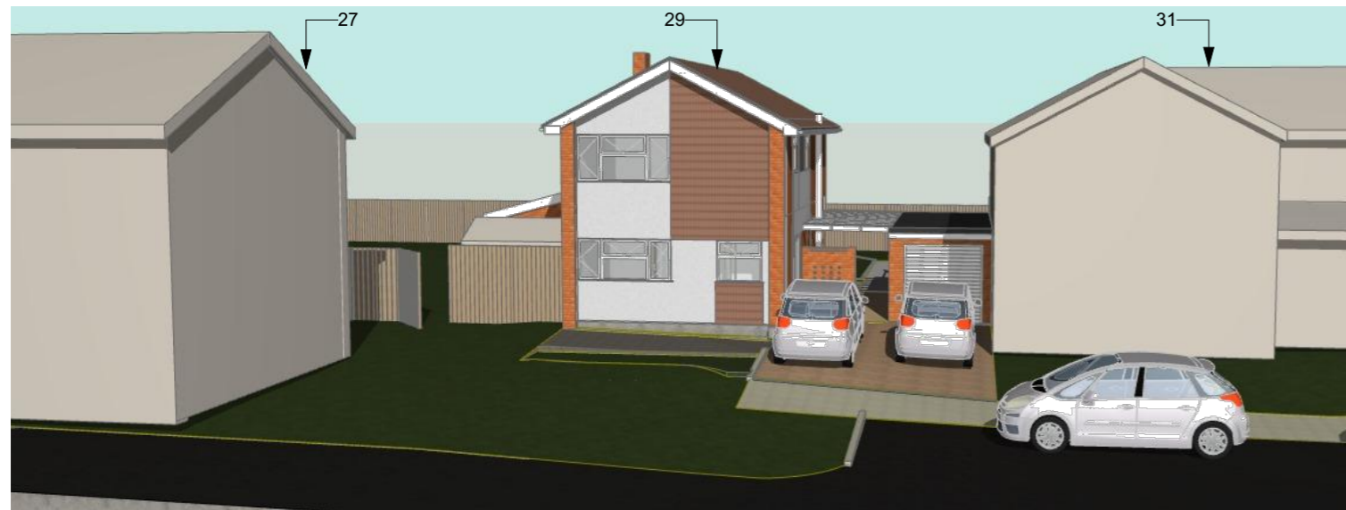
GENERAL STREET SCENE 3D VIEW 29 Beaufort Road, Fleet