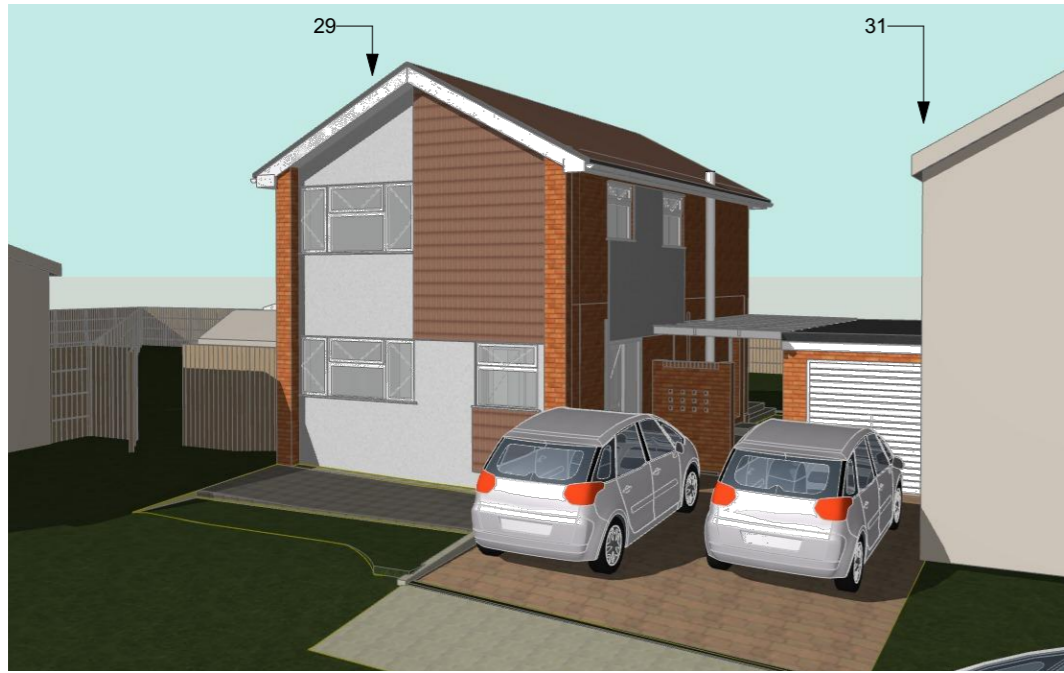
EXISTING FRONT 3D VIEW 29 Beaufort Road, Fleet