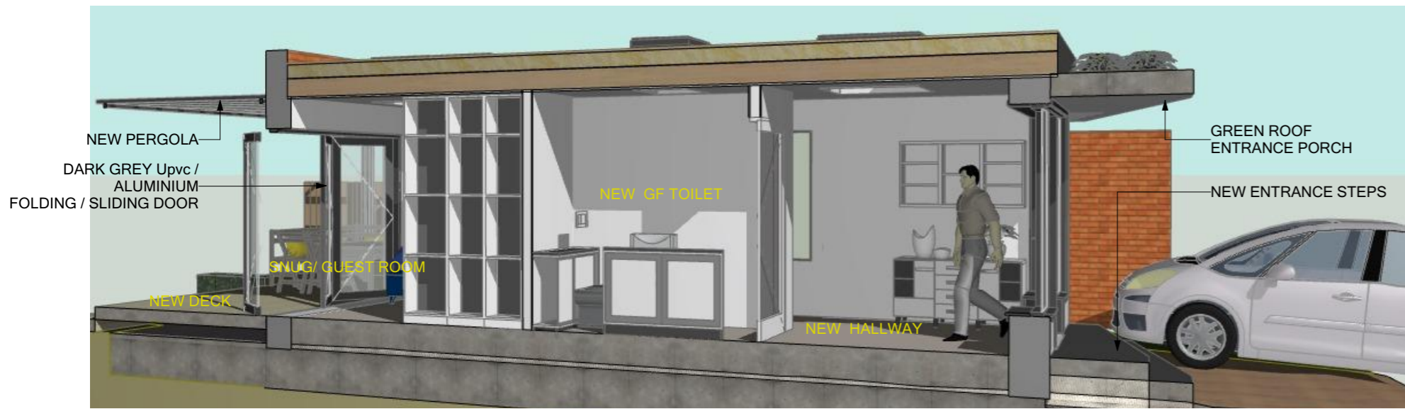
PROPOSED LONGITUDINAL SEC-VIEW