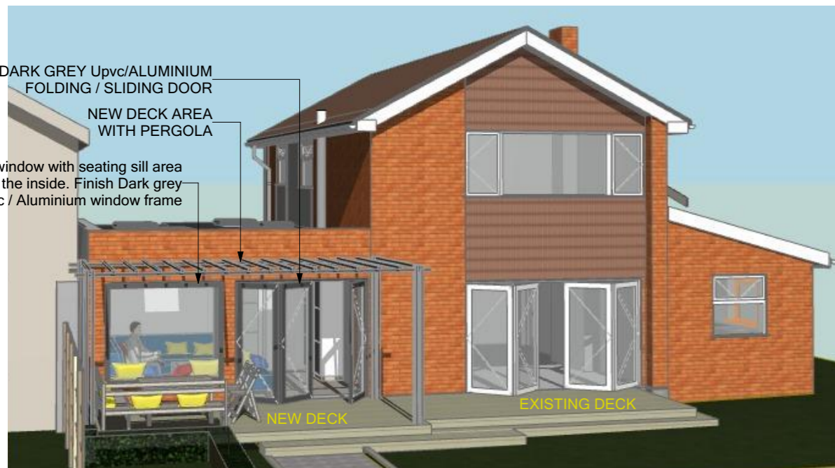
PROPOSED REAR 3D VIEW