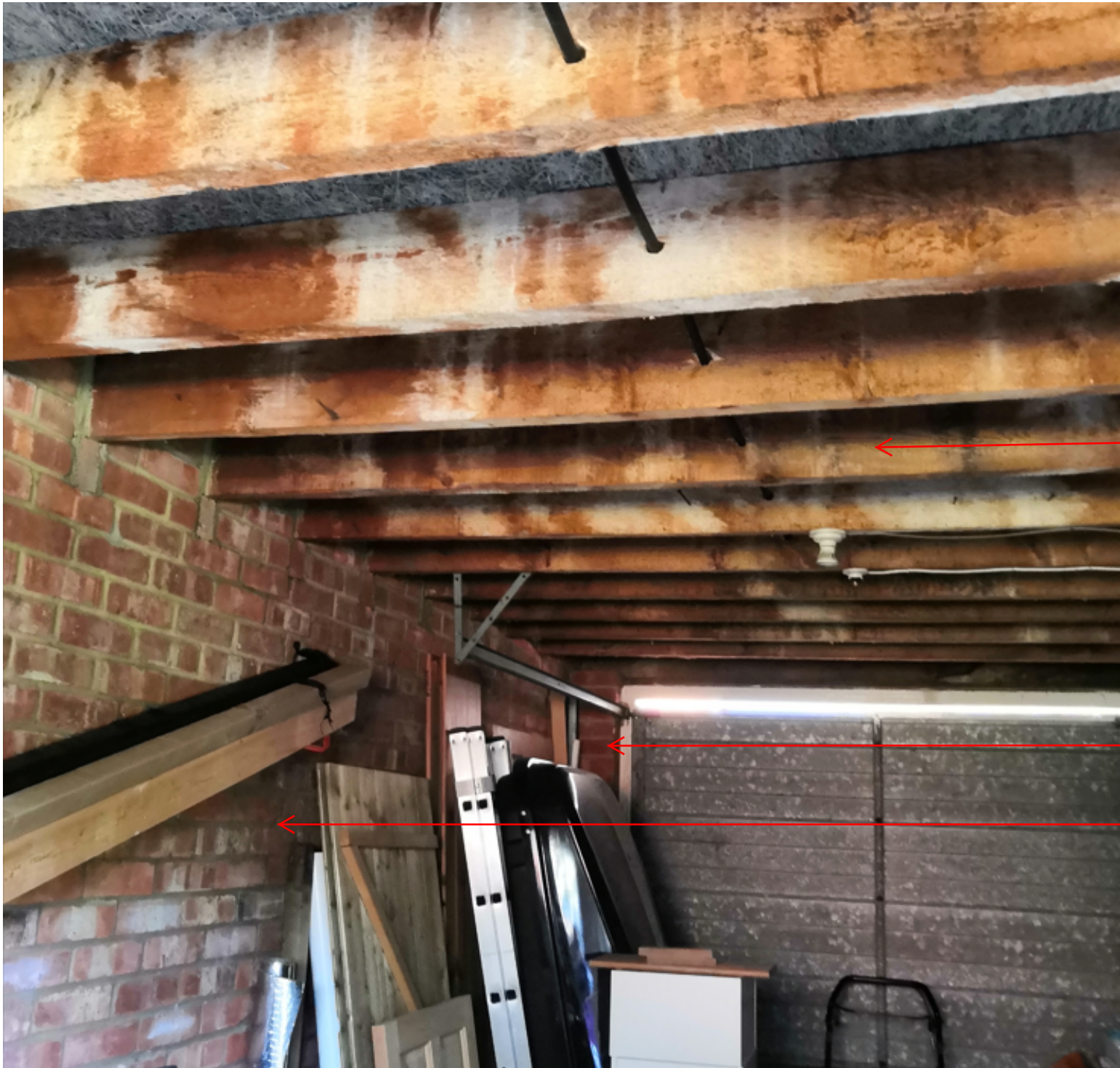
No. 29 Garage Roof Joists