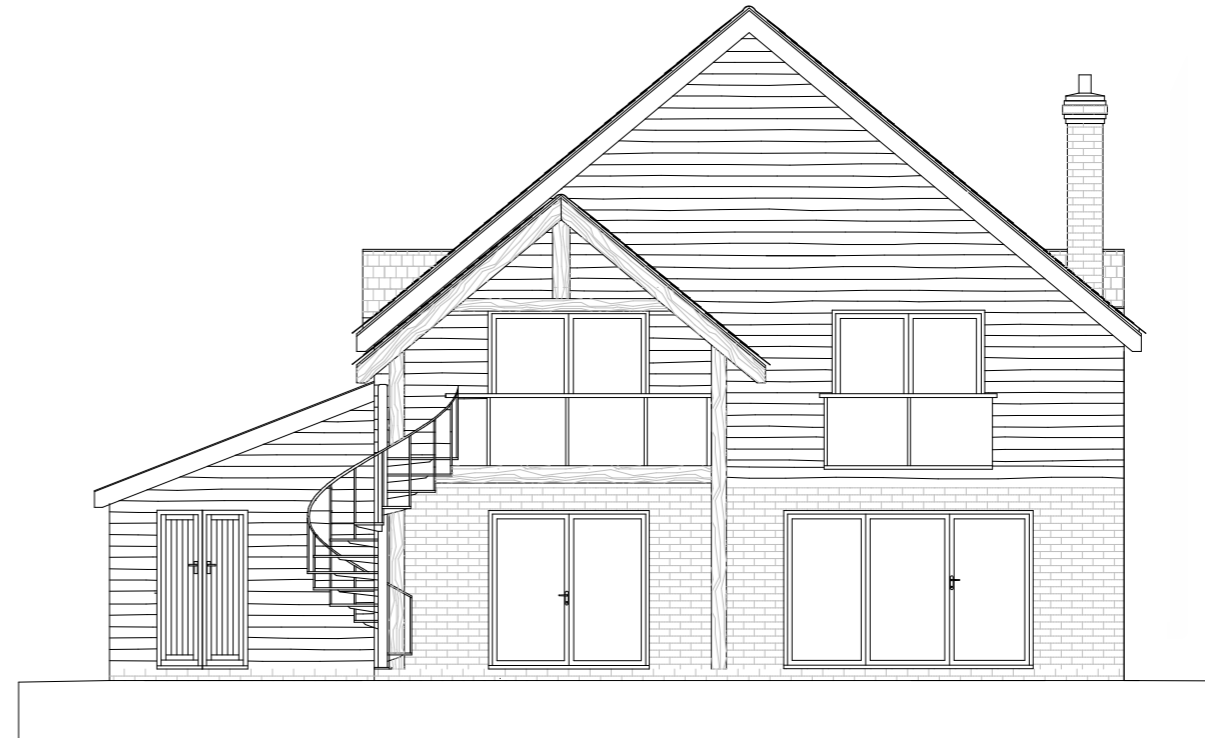
North West Elevation (Rear)