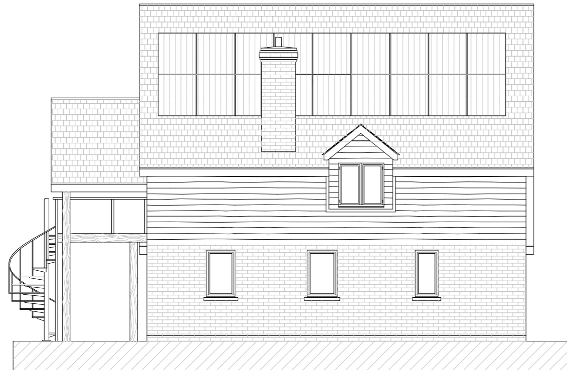
South West Elevation (Side)