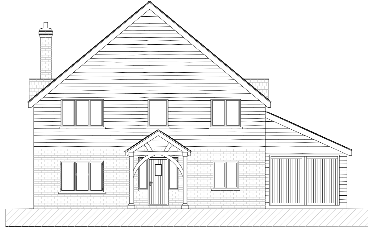
South East Elevation (Front)