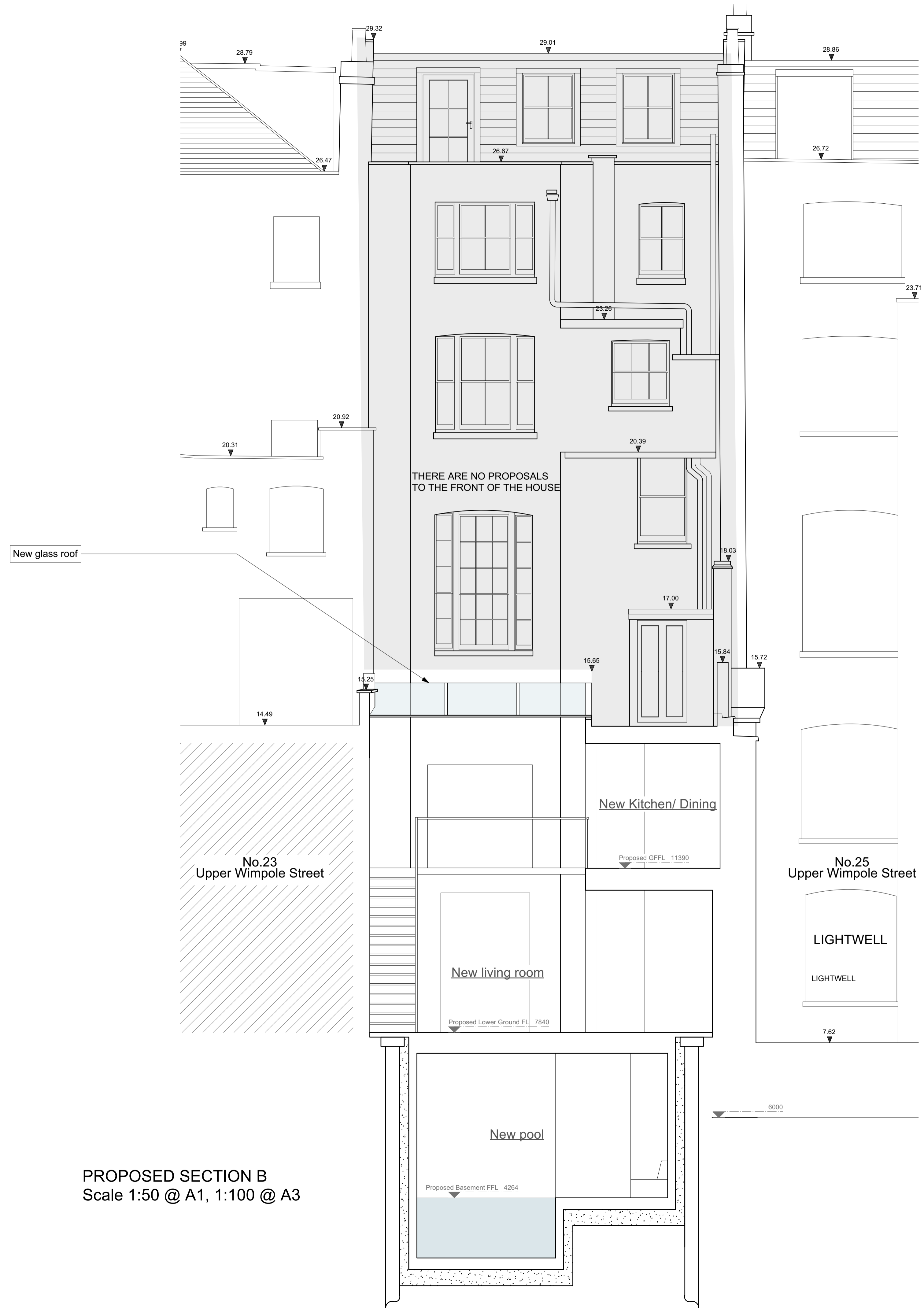
PROPOSED SECTION B Scale 1:50 @ A1, 1:100 @ A3