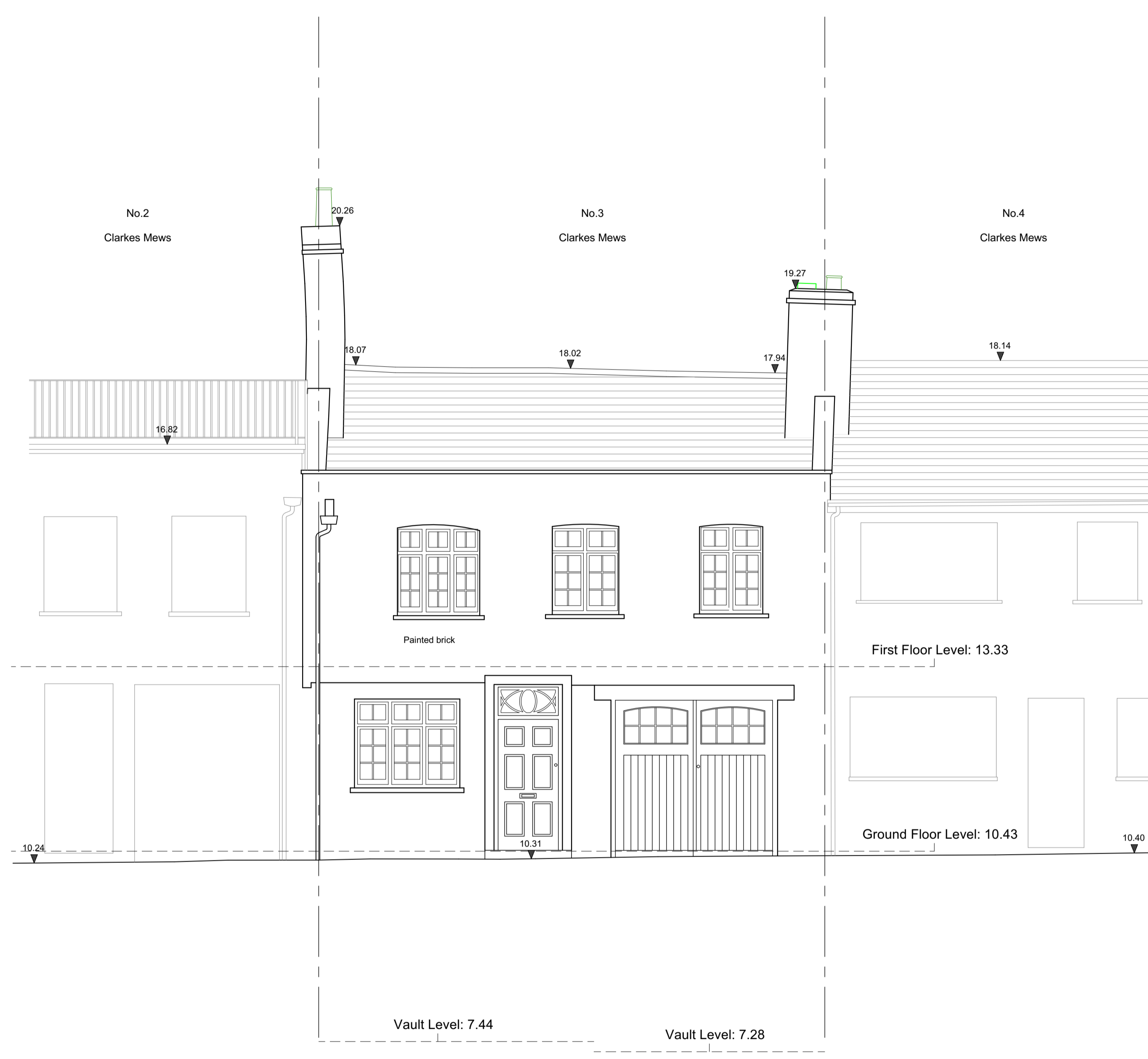
1 Existing Front Elevation Scale: 1:50