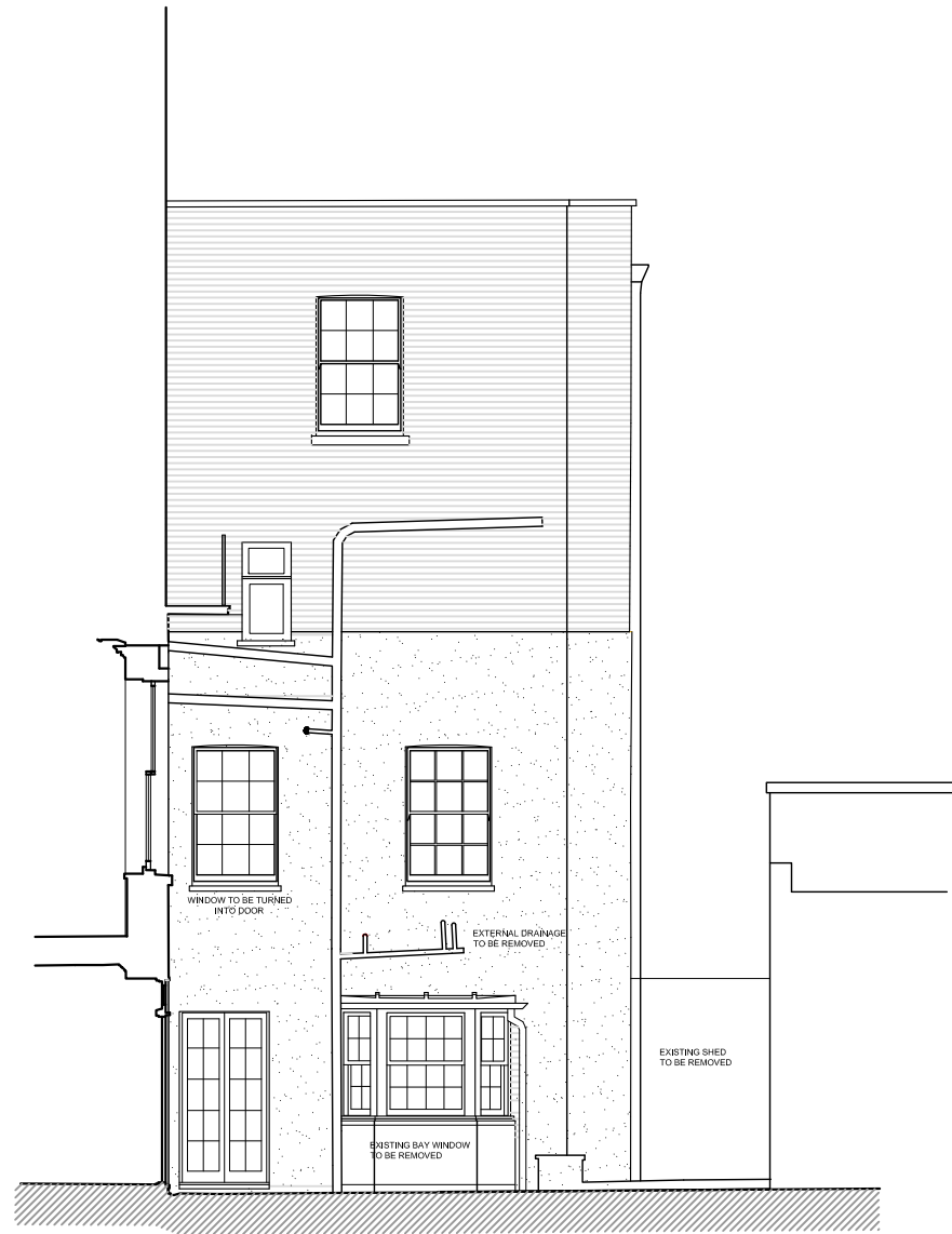
SIDE ELEVATION - Existing