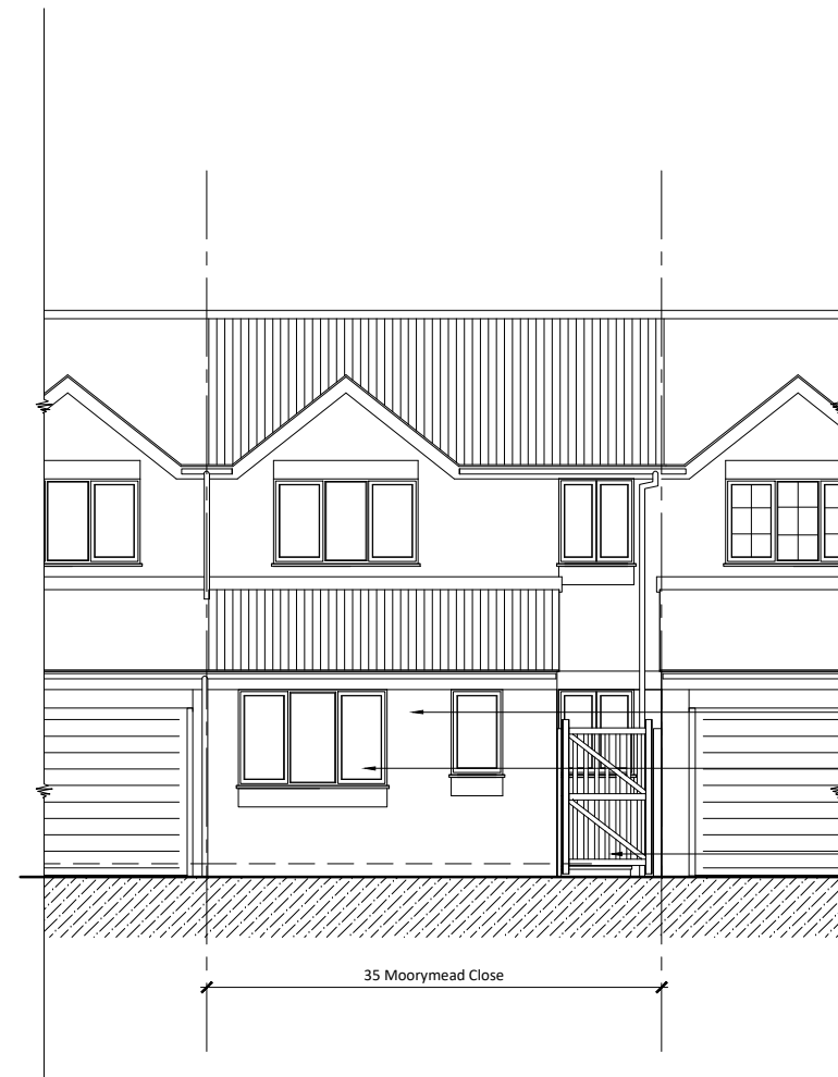
FRONT ELEVATION - AS PROPOSED (following garage conversion) FACING SOUTH-WEST

Garage converted to create additional ground floor accommodation. Garage door replaced with brick work to match existing and casement window to match existing in style and material inserted with brick soldier course detail below. Timber hit and miss gateway erected at principal entrance for privacy and security reason