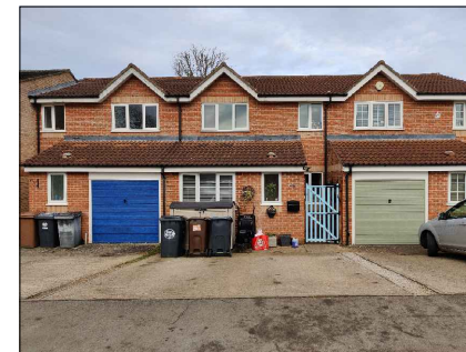
PHOTOGRAPHIC IMAGE Principal elevation viewed from highway indicating 35 Moorymead Close after the garage conversion work (as found currently)

Garage converted to create additional ground floor accommodation. Garage door replaced with brick work to match existing and casement window to match existing in style and material inserted with brick soldier course detail below. Timber hit and miss gateway erected at principal entrance for privacy and security reason