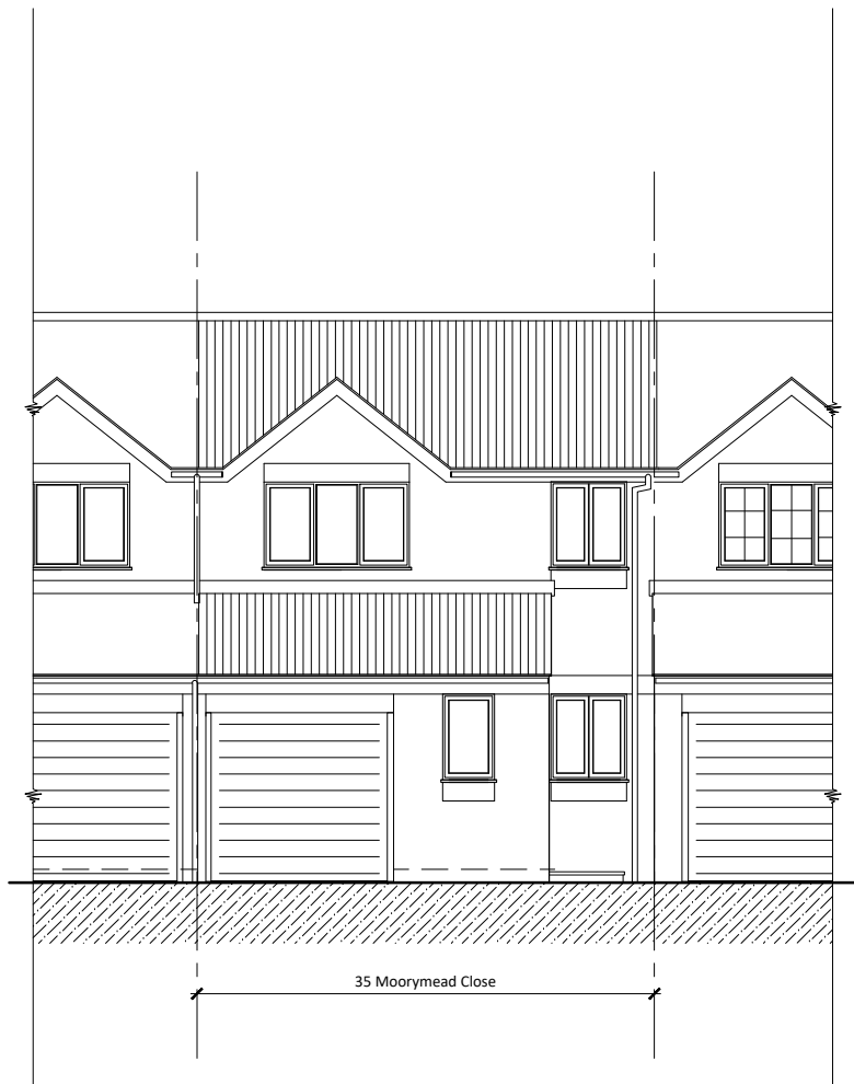
FRONT ELEVATION - AS EXISTING (prior to garage conversion) FACING SOUTH-WEST