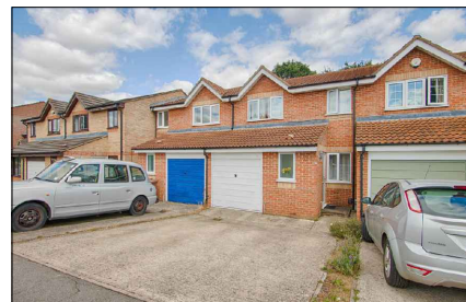
PHOTOGRAPHIC IMAGE Principal elevation viewed from highway indicating 35 Moorymead Close prior to the garage conversion