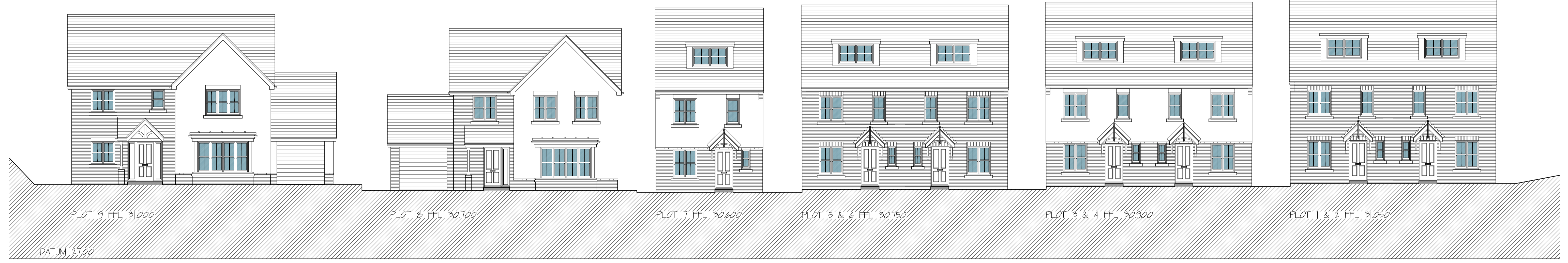
SECTION THROUGH ACCESS ROAD