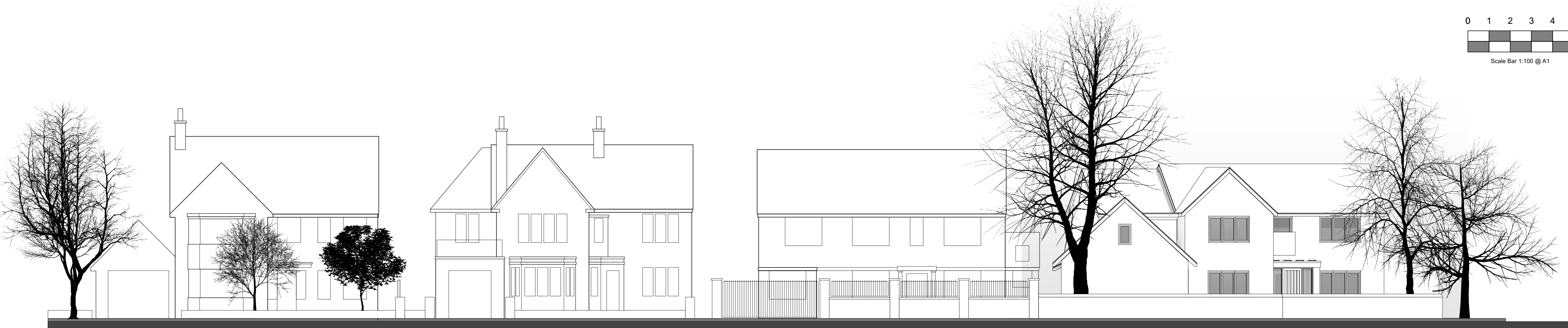
PROPOSED STREET SCENE ELEVATION Scale: 1:100