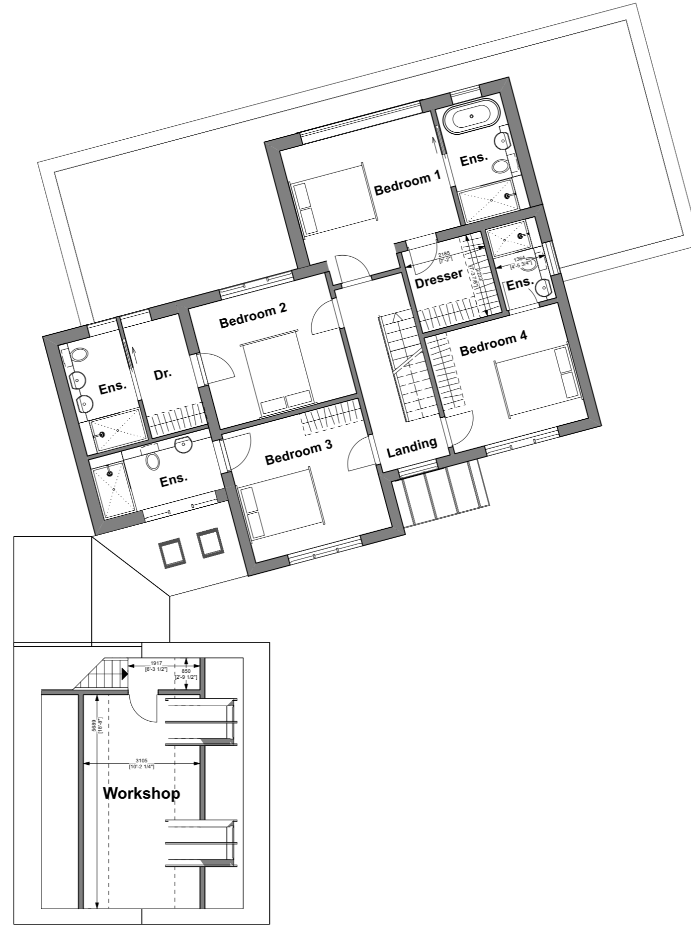
FIRST FLOOR PLAN Scale: 1:100