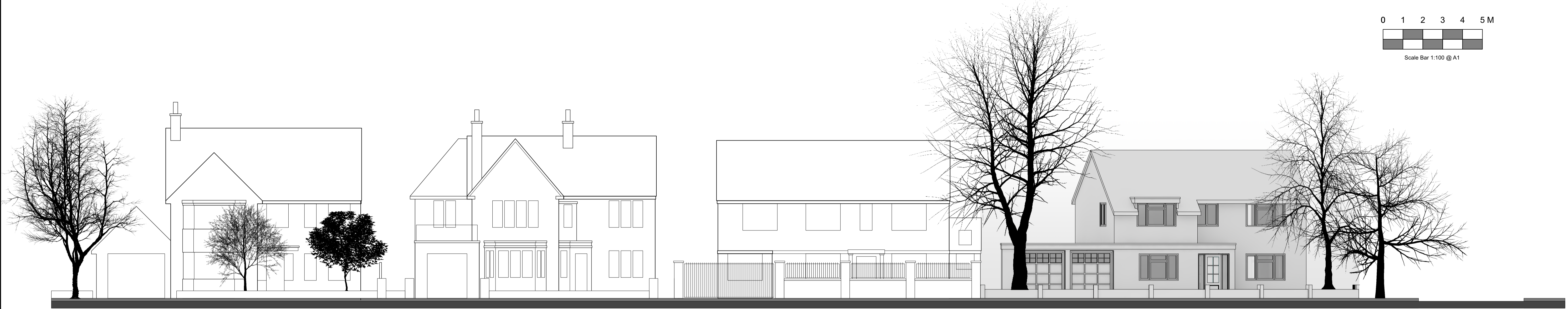
STREET SCENE ELEVATION Scale: 1:100