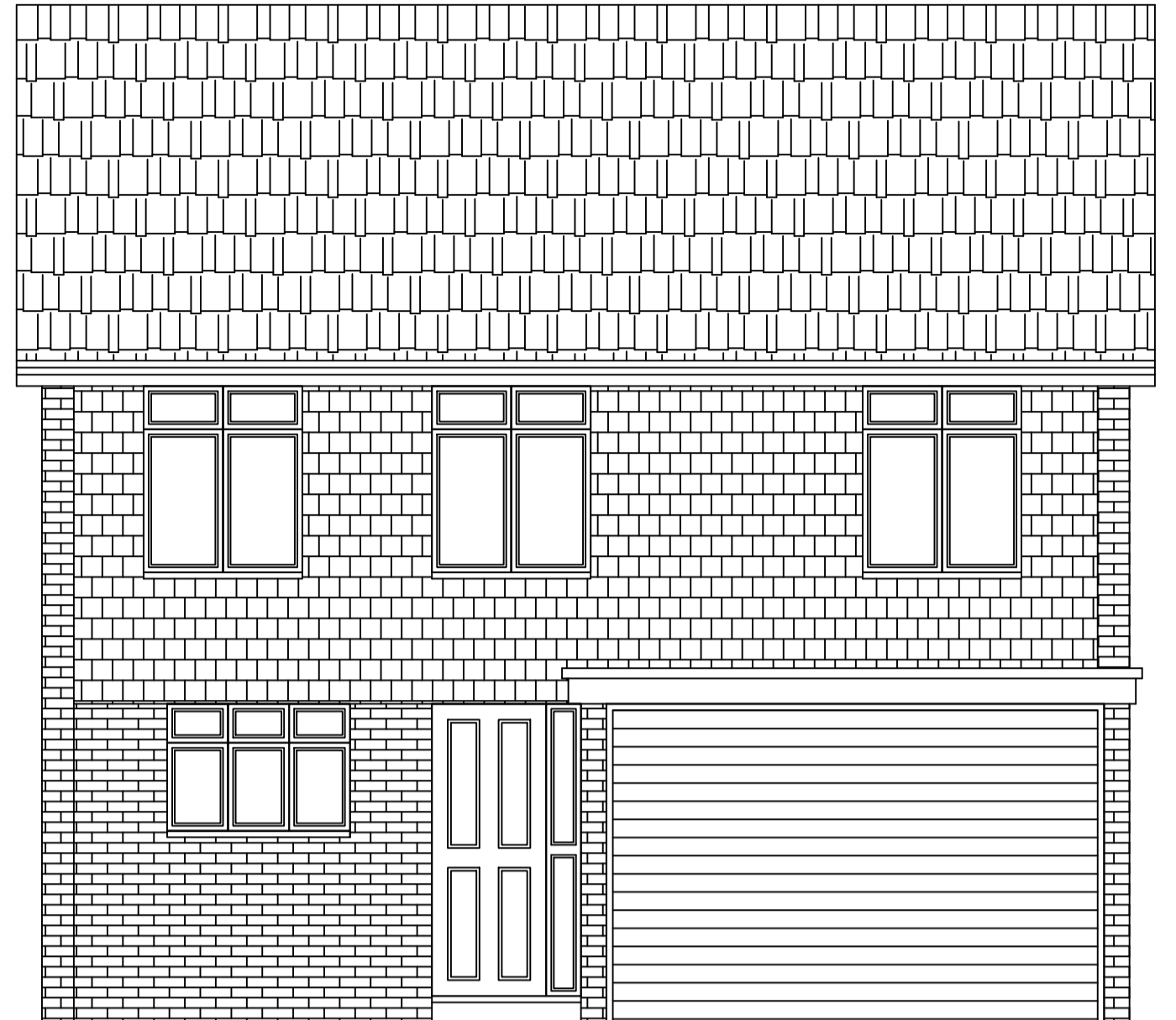
EXISTING FRONT ELEVATION (scale 1:50)