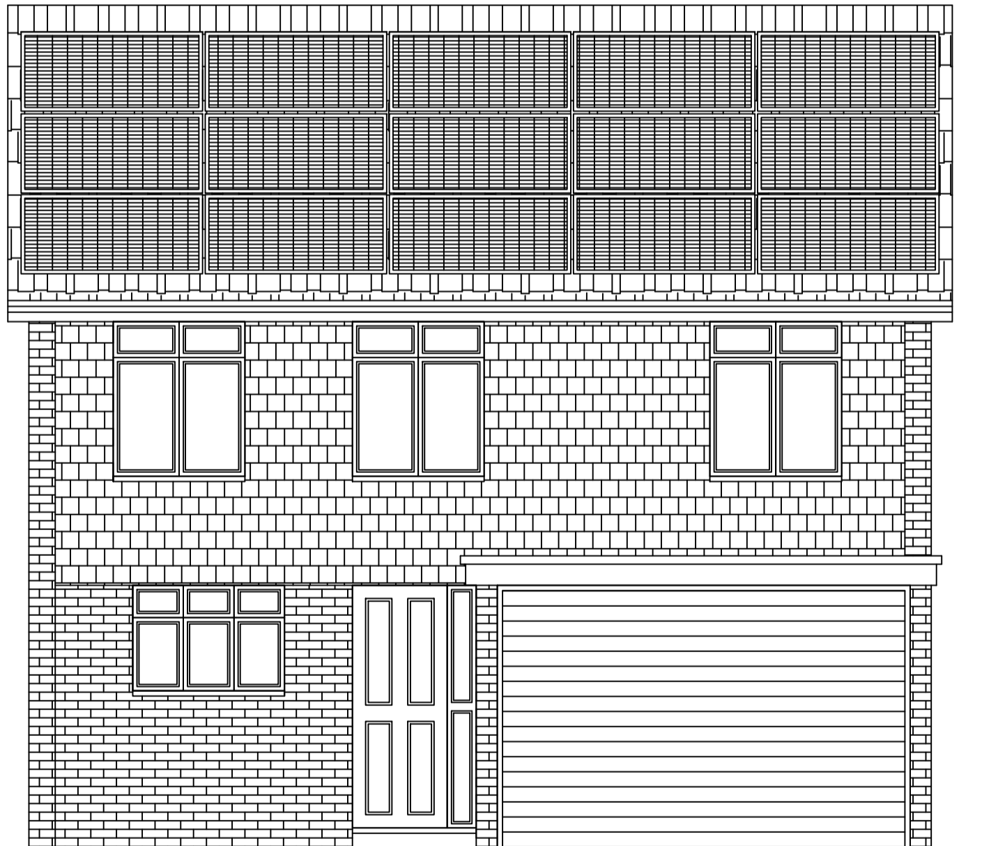
PROPOSED FRONT ELEVATION (scale 1:50)